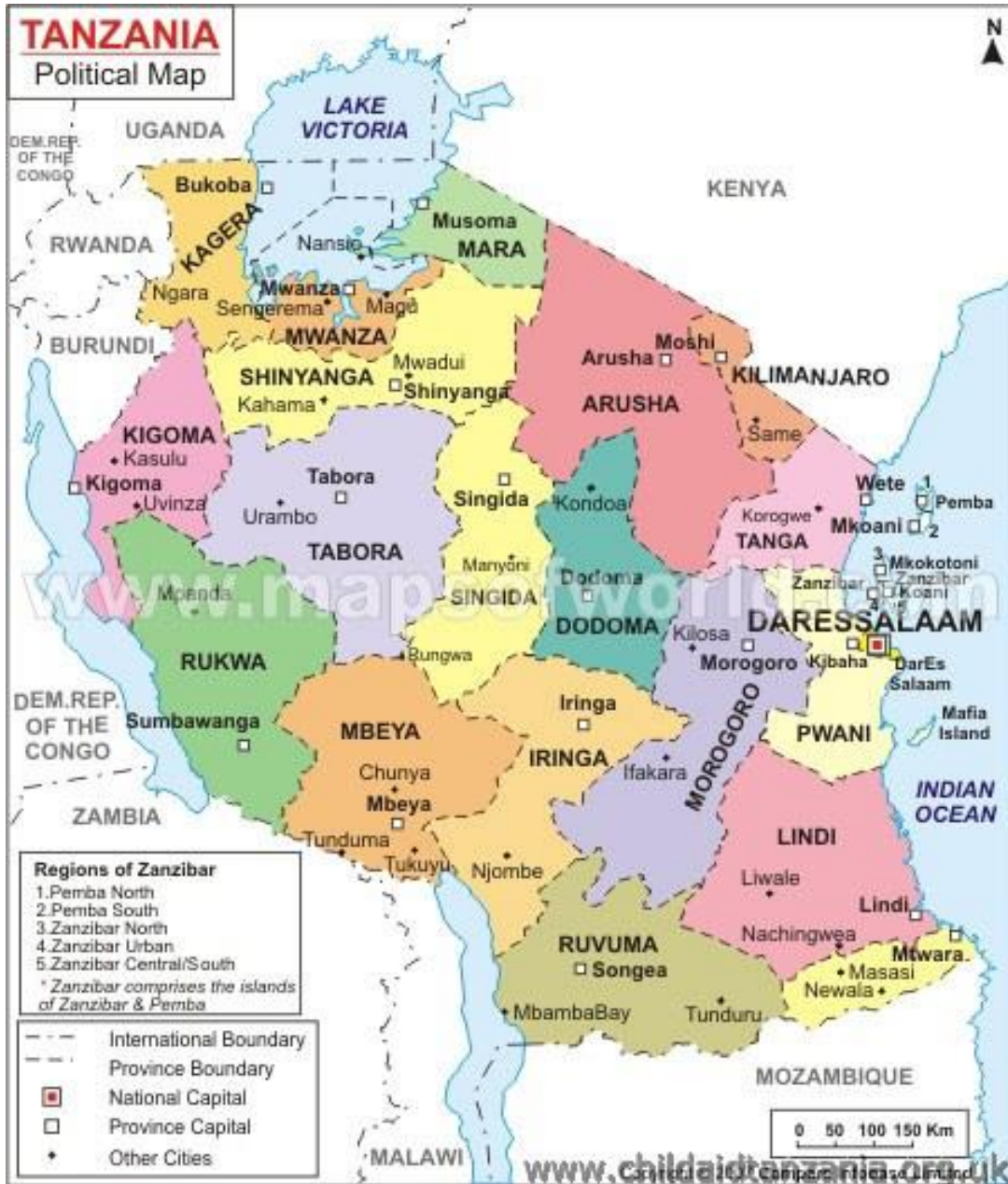
The Map of Tanzania showing regions including Tanga region where I conducted my study