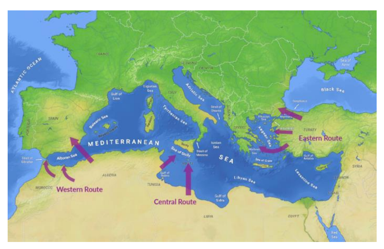
Appendix 1: Main Unauthorized Border Crossing Routes into the European Union