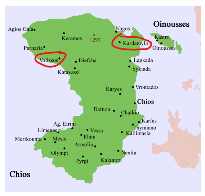
Map 5: Map of Chios, with Volissos and Kardamyla marked in red circles.

opposite Chios, from Sidoussa and Pteleum...and from Lesbos itself. Landings were made at Cardamyle and Boliscus, where the Chian forces coming to resist them were defeated with many casualties...they were defeated again in another battle at Phanae, and in a third battle at Leuconium".<sup>149</sup>