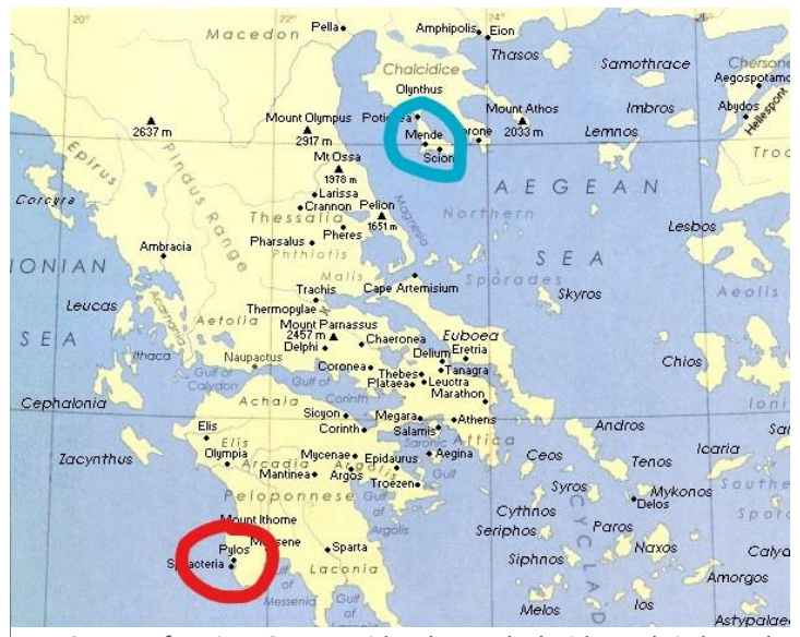
Map 3: Map of Ancient Greece, with Pylos marked with a red circle, and Mende and Scione marked with a blue circle.

Thucydides tells us that in all the confusion "...the Spartans were virtually fighting a sea-battle from land, and the Athenians, victors eager to take maximum advantage of their present fortune, were fighting an infantry battle from their ships". <sup>90</sup> The Athenians won this battle, set up a trophy, and it was seen as a major disaster for the Spartans.