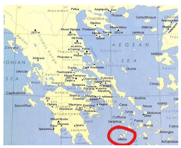
Map 4: Map of Ancient Greece, with Melos marked with a red circle.

Again looking at the percentage, Chios roams around the 20% mark with roughly 16% of the total fleet, and also interesting is that they contributed three times as many ships as Lesbos did. Two things are noteworthy here. Firstly, Thucydides mentions Chios and Lesbos as two separate units for the first time, instead of as a combined force, as he has done earlier. Secondly, this passage further enhances the notion that Chios contributed more ships to the Athenian war effort than Lesbos earlier as