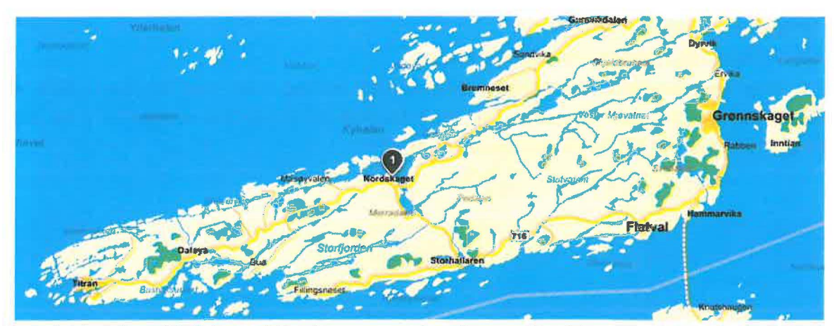
Fig. 3. The location of SalMar and Nutrimar processing plants at Nordskaget, Frøya.

made (Fig. 4). In conjunction with the plant, fresh rest raw materials are transferred to the new Nutrimar plant located next door. Here, salmon oil, fish meal and protein concentrate will be produced on a routinely basis.