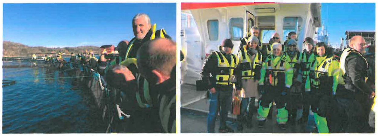
Fig. 2. Visit to Måsøval Fiskeoppdrett AS after boat-trip from Flatval, Frøya.

After lunch at Hotel Frøya, the next stop was at the SalMar processing plant located at Nordskaget, Frøya (Fig. 3). The plant is probably the most modern in the world for the first-processing (slaughter and processing) of salmonids. The main product is gutted salmon on ice but also different fillet products are