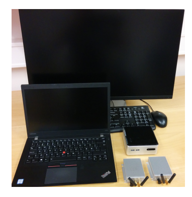
Figure 2: Experimental Hardware (excluding UEs)

User Equipment. We used a Samsung Galaxy S4 device to find the LTE channels and TACs used in the targeted area. For testing the IMSI Catcher, we used two LG Nexus 5X phones running Android v6. We used different USIMs