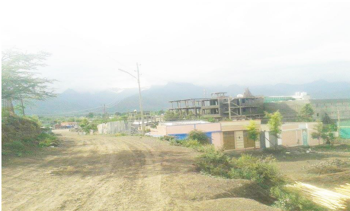
Figure 4.2. Partial image of the town from distance

Many youths like Abebe left their school and migrated to the Middle East. Their migration has many implications for the local community. At first, as you can understand from the above case presented by Abebe, migration has economic and family related motives for youth migration to the Middle East.