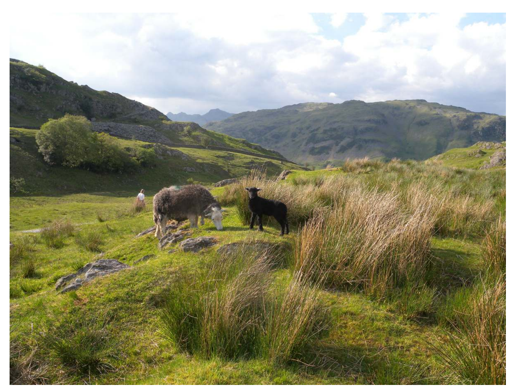
Figure 3 : Pastoral scene from the Lake District, England, showing the heritage breed of Herdwick sheep

treasured as cultural heritage in places ranging from New York's Central Park to Paris' Parc Monceau, and the lawn has become a ubiquitous element in places ranging from suburban sub-divisions to social housing. Versions of the pastoral landscape are also treasured in wilder forms in many of the world's iconic national parks such Yosemite and Yellowstone in the United States, the Cévennes in France, or the Lake Disctrict in England (Figure 3), not only for their landscapes esthetics, but by also for their biodiversity (Olwig 1996). It is this « used » landscape type, I will argue, that continues to be valued as key to the natural heritage of contemporary society, not simply because of the material, qualities of this landscape as physical thing, but also because of its cultural inheritance as a symbol of the things that people share as a « res publica », and which they therefore can never own, but can only pass on to the next generation.