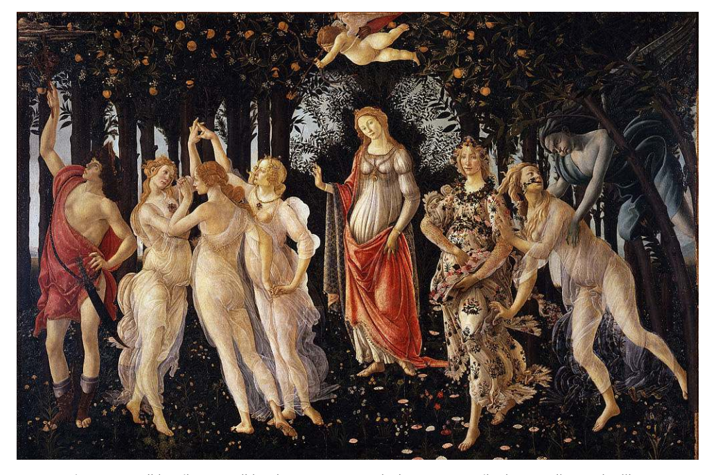
Figure 2 : Sandro Botticelli's Primavera

plant species depicted in the painting, with about 190 different flowers (Fossi 1998 : 5 ; Capretti 2002 : 49) (Figure 2).