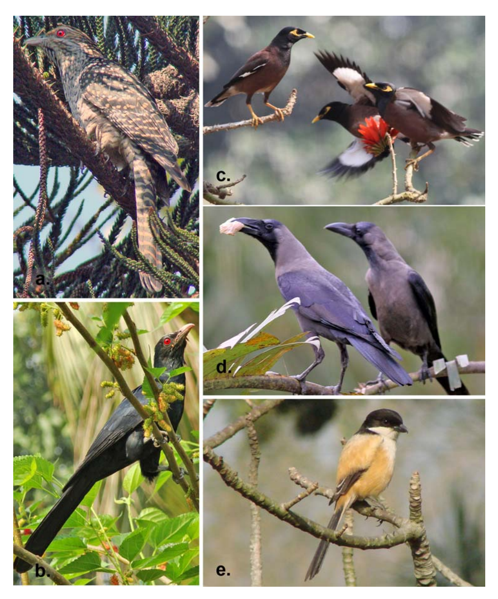
Fig. 3. Asian koel and its hosts; a. female koel, b. male koel, c. common myna, d. house crow, e. long- tailed shrike

The Asian koel is the most common resident among the cuckoos in the study area (Fig. 3). Each of the host species of Asian koel is a common resident and is also widely distributed throughout Bangladesh. The house crow and the common myna mostly inhabit areas near humans, as they are highly opportunistic omnivores (Feare and Craig 1999), while the long-tailed shrike more commonly occurs in open mixed forests and bushes with scattered trees. These host species are described in detail in paper I (Fig. 3).