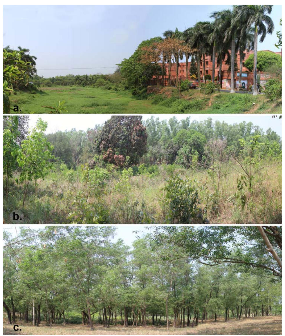
Fig. 2. Different cuckoo habitats in the study area; a. Human habitations,b. Mixed scrub forests, c. Monotypic plantations.

In addition, the area consists of agricultural lands, orchards and botanical gardens in and around human settlements. A total of 180 bird species, including 76 passerines and 104 non-passerines, have been recorded in the area. In total, 34 passerine species have been found to be breeding residents (Mohsanin and Khan 2009).