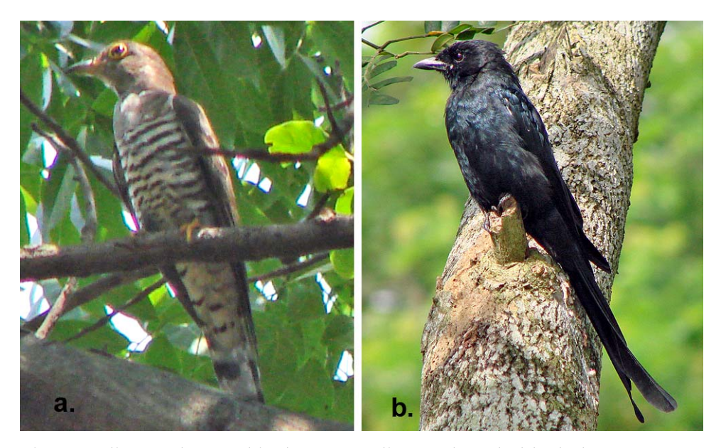
Fig. 4. Indian cuckoo and its host; a. Indian cuckoo, b. black drongo

The black drongo is one of the most common and widely distributed passerine birds throughout the Indian sub-continent (see Payne 2005) (Fig. 4). They feed on insects (mainly agricultural pests) and breed in trees, usually near the fringe of a branch. Their breeding season lasts from April to August, with a peak in May or June (Ali and Ripley 1987) in different areas. In Bangladesh, their clutch consists of 3–4 eggs. Their incubation period is normally around 15 days, and the nestlings are in the nest for about 19 days (Ali and Ripley 1987).