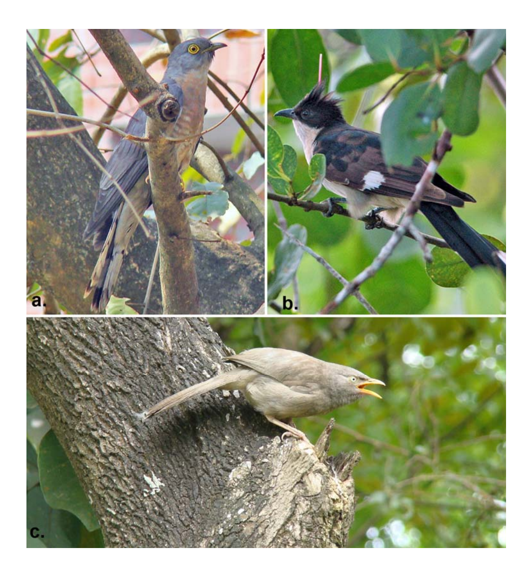
Fig. 5. a. Common hawk cuckoo b. pied cuckoo c. jungle babbler, a host for both cuckoo species