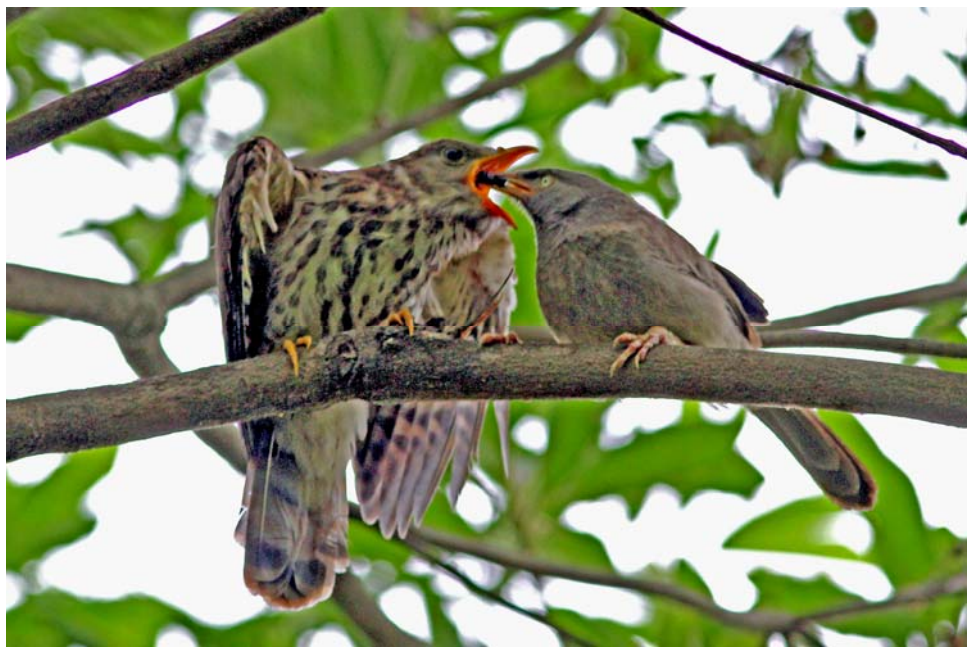
Common hawk cuckoo ( Cuculus varius ) fed by its host, a jungle babbler ( Turdoids striatus ).