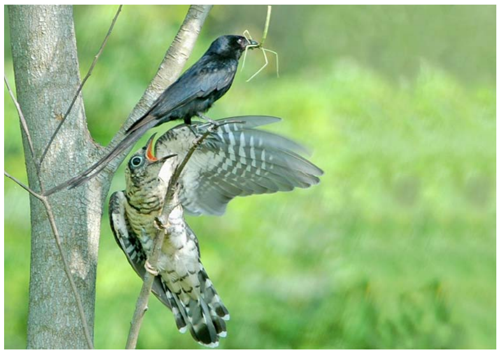
Indian cuckoo ( Cuculus micropterus ) fed by its host, a black drongo ( Dicrurus macrocercus ).