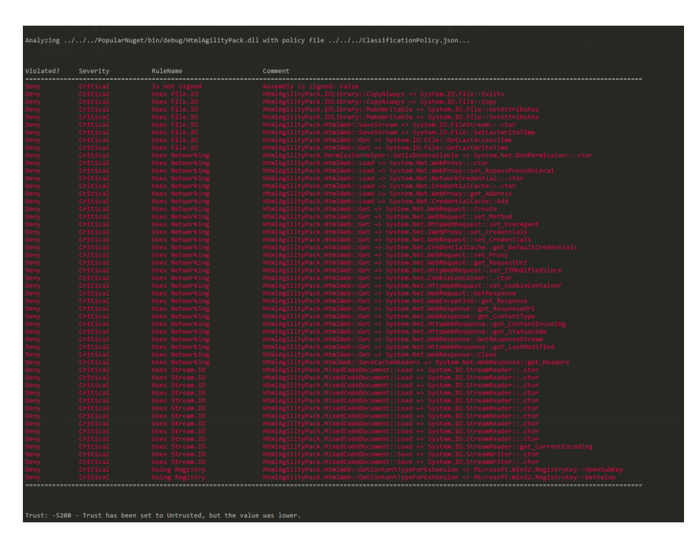
Figure 3: GuardiNET analyzing HtmlAgilityPack