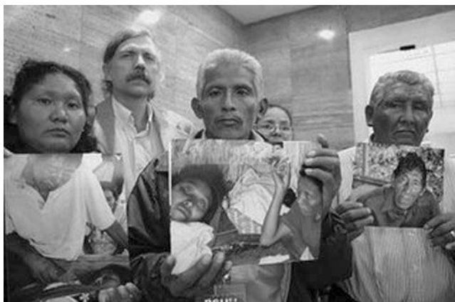
Figure 4. El Nacional photograph taken during confrontation in ministry's lobby.

seems as if the lives of us Warao . . . aren't worth anything to the criollo world." The photograph multiplied claims to the grievability of Elbia's life, refracted through images of mourning and the trip to Caracas. In the El Nacional article, Enrique interpellates the body politic through the figure of Chávez: "We invite the President to come to our funerals," thereby ambiguously including deaths past and future.