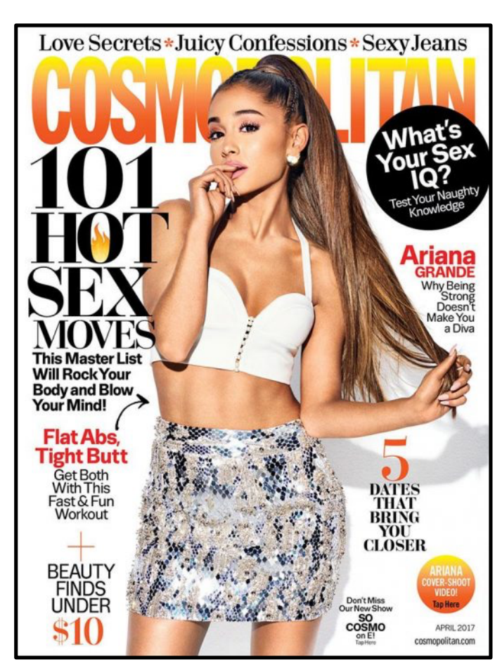
("Cover, Cosmopolitan, April," 2017)

American magazines, feel all too common. This is especially the case for certain publications like Cosmopolitan , which have become famously known for such rhetoric. For example, the cover of the April 2017 issue of US Cosmopolitan features an article entitled "101 Hot Sex Moves. This Master List Will Rock Your Body and Blow Your Mind!", and the cover of the March 2017 issue advertises for an article entitled "The #1 Way To Tell If He's <u>Truly</u> Into You," ("Cover, Cosmopolitan , April," 2017; "Cover,