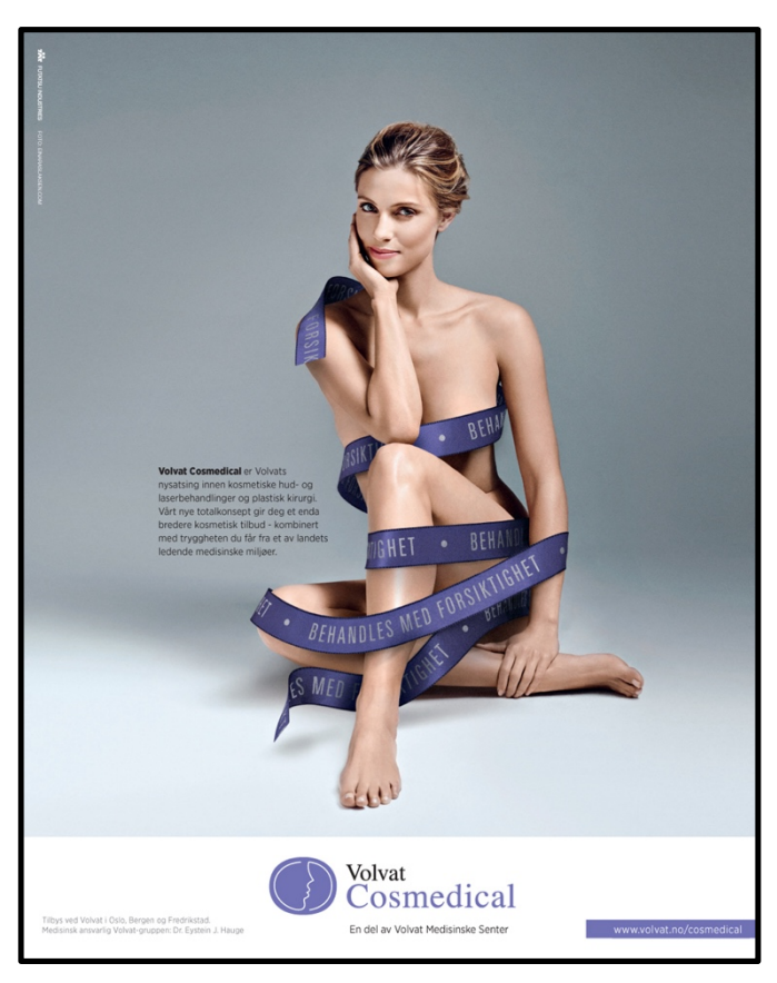
("Volvat Cosmedical [Advertisement]," 2016) In consideration to photo quality, the above advertisement picture is retrieved from an Internet source rather than directly from Stella, but all aspects of the advertisement are exactly the same as they appear in Stella Issue No. 3/2016.

editorial content is leaps away from the way in which the advertisements portray women. However, the unfortunate reality of it is that these contradictory portrayals end up being placed side by side in the magazine, which can send confusing messages to readers trying to navigate through Stella 's rhetoric. Sometimes these contradictions can become very blatant, causing all the more confusion, such as can be seen with the examples of two different plastic surgery advertisements on the pages of Stella . One of these examples comes in an issue that also highlights women in tech and gives tips about when you know it's time to change jobs, and another is placed in an issue that features editorial content such as a feature on jobs within digital and technological career fields, and an article questioning whether the new diet trends have gone too far. Thus, this creates confusing and contradictory juxtapositions of the portrayal of womanhood.