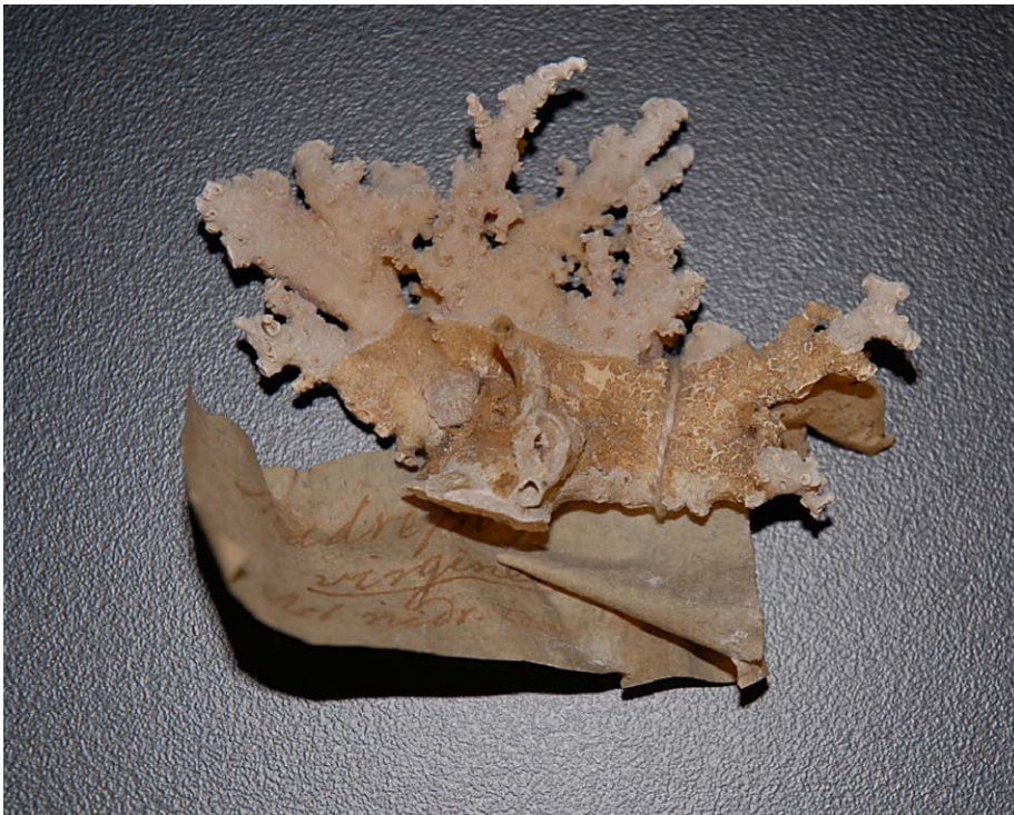
Figure 2: The original specimen of Stylaster norvegicus , with original label.

Other specimens of the same species may be represented in the collection, but neither labels (no original labels exist) nor studies published by specialists (Broch 1914; Zibrowius & Cairns 2005) indicate this.