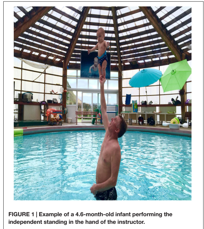
FIGURE 1 | Example of a 4.6-month-old infant performing the independent standing in the hand of the instructor.

As stated by Hedberg et al. (2007), there are methodological challenges associated with studying the development of independent standing, as infants under the age of 9 months per se are not expected to be able to stand independently. In order to explore independent standing, 3–5 months old infants participating in a baby swimming course were recruited to participate in the study. Choosing this kind of context was mainly based on anecdotal evidence and observations of the instructor that emphasized independent standing as a central task in the water-based program (Figure 1) in which infants appeared to demonstrate early signs of motor learning/postural readiness. Also, it was considered as a safe and joyful context for the infant and their parents to study this specific motor behavior. Given the age of the participating infants, indications of motor learning in the standing tasks could imply earlier signs of experience-dependent independent standing than previously reported in the literature (Hadders-Algra, 2005; Claxton et al., 2013). In other words, the study of infants engaging in these tasks enables investigation of task-specific independent standing among putative non-standing infants. Subsequently, the aim of this explorative study on a specific independent standing tasks, conducted as a part of a baby swimming routine over a period of 12 weeks (24 sessions), was to examine whether young infants improved their performance as measured by prolonged time-to-stand.