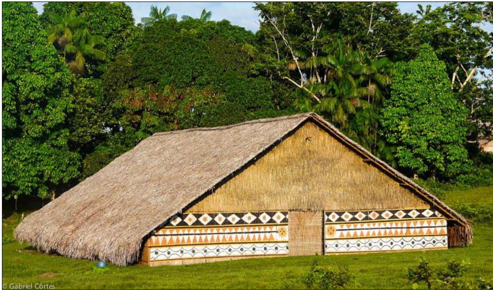
Figure 3: A typical “Maloca”, a symbol of the indigenous cultural revival in the Rio Negro (FOIRN n.d.-f)

In 1995, the IV FOIRN Assembly took place. In the occasion, the book series “Narradores Indígenas do Rio Negro” (Rio Negro Indigenous Narrators) was released, with the aim to gather original manuscripts made by the Indigenous of the Rio Negro. Its first edition contained the most important myths of the Dessana ethnic group. It interesting to note that the targeted public for the book were the Indigenous Peoples themselves, with 2.000 editions distributed among schools in the region. This can be understood as a way these people work out their identity politics, retelling their old myths and traditions in order to reinforce the local indigenous identity and create the sense of belonging. It also states the importance of FOIRN and its international alliance for the cultural revival in the area: