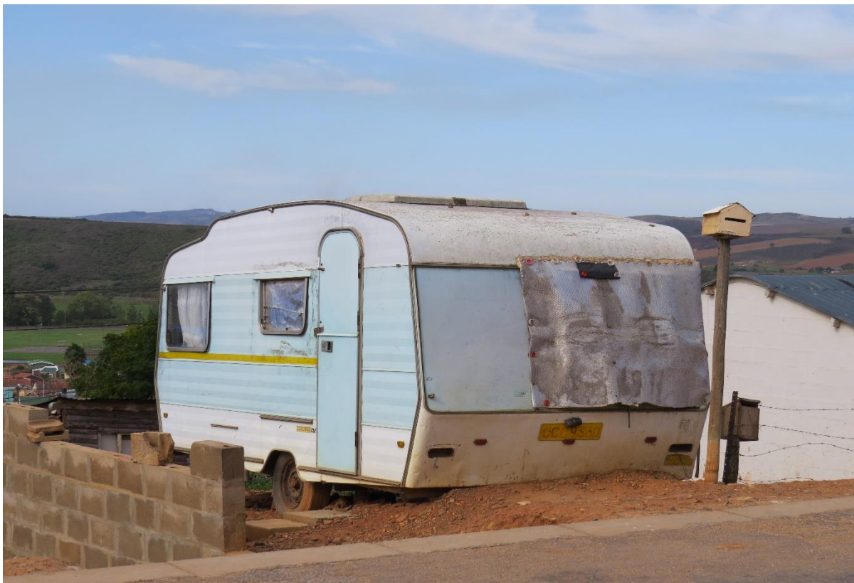
Figure 7 Improvised housing

Most of the people from this social stratum had the right to the free 6000 liters of water on account of them not having a stable income. This meant that the ones living in a small household used almost nothing on water, while those living with many children or relatives spent a whole lot more, or could not afford water by the end of the month because the 6000-liter allowance simply was not enough for a large family. There were some complaints about this matter because access to such things as water and electricity were seen as crucial commodities that everyone had a right to. This was also the group of people where the use of prepaid water meters was most prevalent. A much larger percentage of the poor that I spoke to had prepaid meters compared to all other groups.