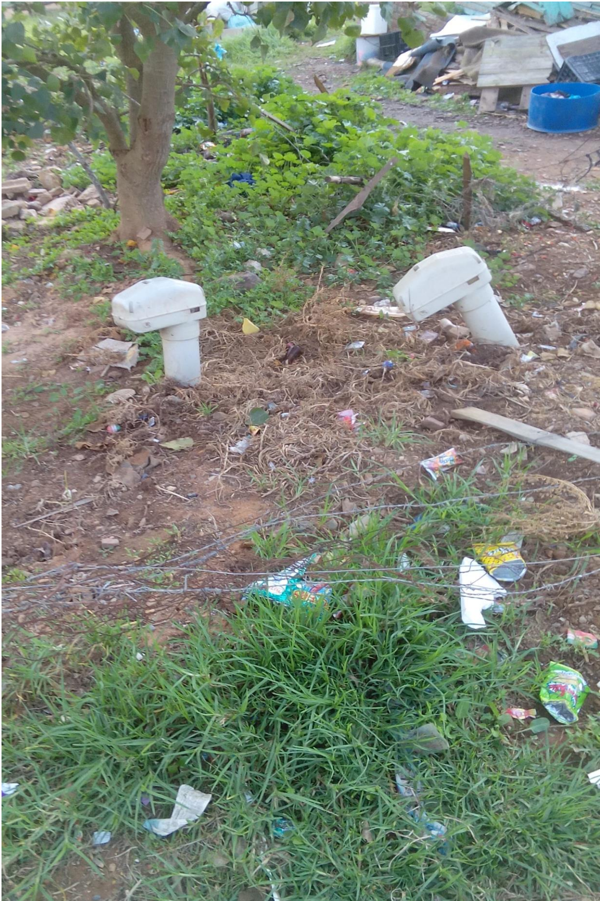
Figure 8 Prepaid water meters