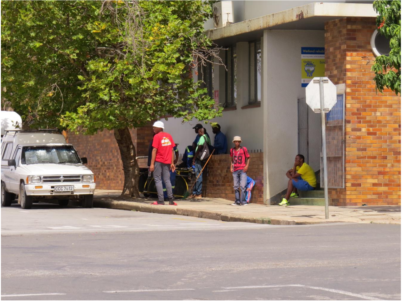
Figure 2 Coloreds waiting to work.