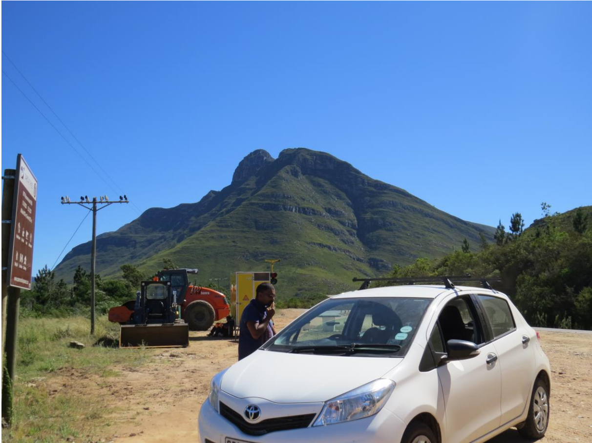
Figure 3 Sleeping Beauty Mountain

Riversdale is the municipal center of the municipality of Hessequa which came about through a merger of three smaller municipalities in 2005. As such the municipal offices are central to the town-scape of Riversdale. The name Hessequa means "people of the trees", and refers to the tribe of Khoi people who used to live in the region. Many of the colored inhabitants of the area still see themselves as belonging to the Khoi tribe, because they are descended from these native South Africans.