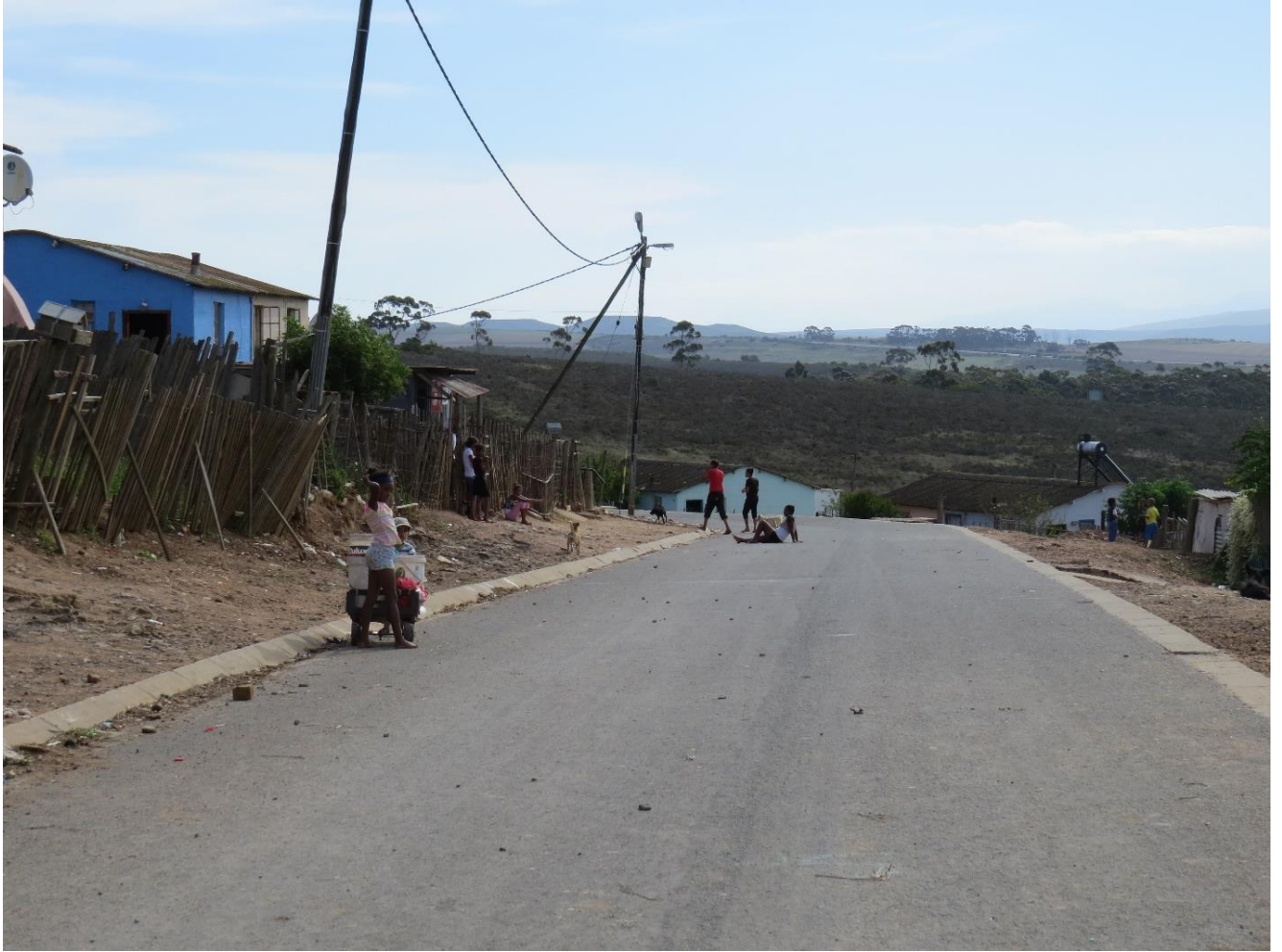
Figure 6 Socialization in the streets of Riversdale