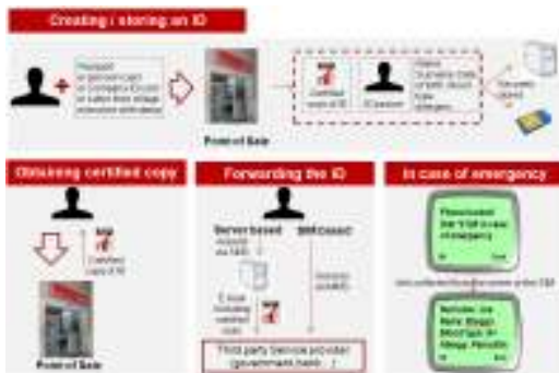
Figure 3 Mobile phone as an identification card

As mentioned earlier a large number of people in developing do not any kind of identification but there is higher probability that they carry a mobile phone. Consequently, it does make sense to transform the mobile phone to an identification card.