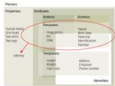
Figure 1 Definition of identity

As defined in [6] an identity is a set of permanent or long-live permanent attributes and personal identifiers associated with an entity such as an individual. With an identity, it must be possible to recognize an individual.