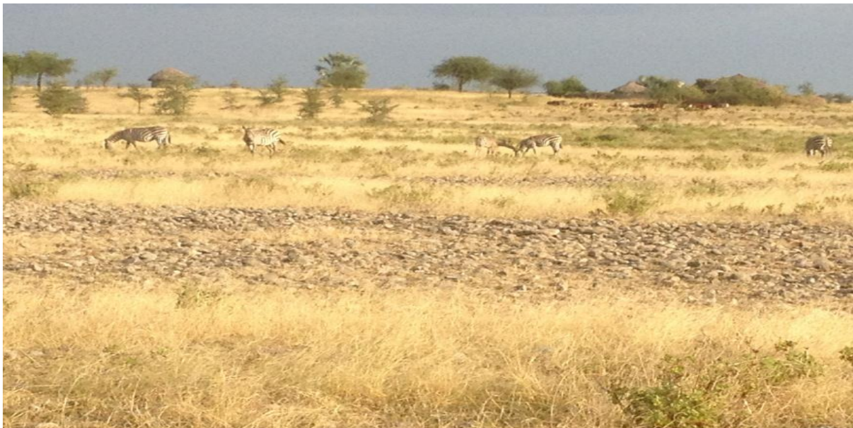
Figure 3: Photo of Zebra grazing on Maasai village land together with cattle

The majority of the respondents (81.8%) were residents either born in the study villages or had migrated into the villages for more than twenty (20) years ago. Most of them were farmers and pastoralists at the same time with differences in magnitudes. Respondents in villages that were found near the northern part of the park were mostly pastoralists with minimal cultivation and those in the western part of the park were mostly farmers. Land ownership/scarcity was not statistically significant but its effect was revealed in one of the study villages (Mwikantsi) where the park decided to redefine its boundary by setting aside approximately 4400 hectares of land to establish a buffer zone. When this proposal was taken to the village general meeting, the assembly voted the land to be divided to youths for agricultural activities since many youths did not have land. Similar findings were also recorded by (Davis, 2011). It was also evident that culture played a great role in shaping community attitudes towards conservation. According to Maasai culture, wild meat is forbidden which makes them more supportive to wildlife conservation (Figure 3) as compared to the rest of the ethnic groups. This finding is also supported by (Sekhar, 2003) who found that temple lands and water catchment areas have simplified conservation of Sariska Tiger Reserve in India.