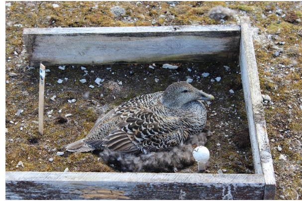
Figure 1. Female common eider ( Somateria mollissima ) with an artificial shelter and the temperature/humidity logger inside. A white plastic ball with air vents was placed around the logger to prevent exposure to direct sunlight.

At first capture, a temperature and humidity logger (iButton Hydrocron DS1921—Maxim Integrated Products, Sunnyvale, CA, USA) was placed approx. 10 cm from the edge of each nest at eider head height (Fig. 1). Ambient temperature and humidity were logged every 10 min until the logger was retrieved at the second capture. In 2014, an anemometer (Davis Instruments, Hayward, CA, USA), logging wind speed and direction, was placed on the island and the wind data were recorded during the whole study period. Mean wind speed measured on the island in 2014 was 2.77 m/s (SD = 0.29) with a mean wind direction of 203.4 degrees (SD = 79.1). Wind