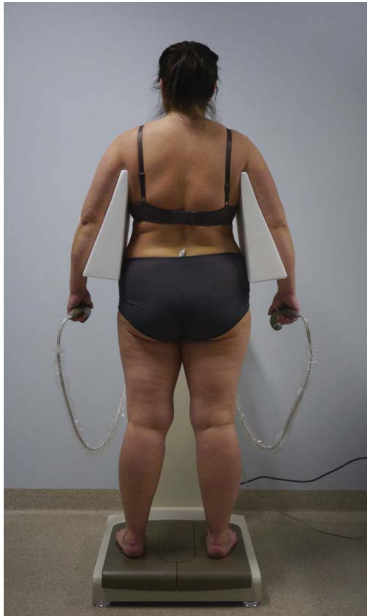
Fig. 1. Study participant measured on InBody 720 using custom-made auxiliary pads.

Roekenes et al.: The Impact of Feet Callosities, Arm Posture, and Usage of Electrolyte Wipes on Body Composition by Bioelectrical Impedance Analysis in Morbidly Obese Adults