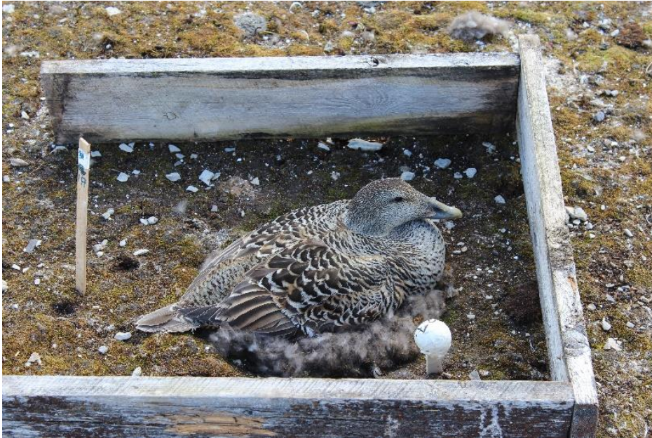
Figure 1. Female common eider with an artificial shelter and the temperature/humidity logger inside. A white plastic ball with air vents was placed around the logger to prevent exposure to direct sunlight.