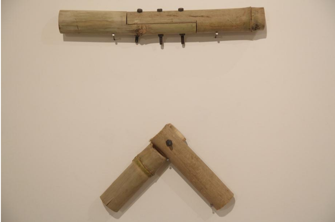
1 x wood joint Saal (ca 40cm)