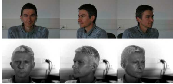
Figure 1. Example of acquired picture database for one person

and adaptability of such algorithms in different wavelength area. These tests allow finding the more accurate method to use within features detection algorithm and to optimize the multiple information we can extract from several wavelength ranges. For this study, we make a database of images of 15 people, with 4 different stands with one reference image, in the visible, Near-Infrared (NIR)-Short Wave Infrared (SWIR), and Long Wave Infrared (LWIR) ranges.