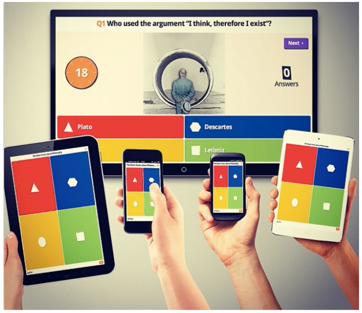
Fig. 2 Giving answers in Kahoot!

When the time to give answers is up, a distribution of the students' answers are shown on the large screen. At the same time, the students get individual feedback on how they have answered on their devices. The distribution of the students' answers gives the teacher feedback on the students understanding of the question, and open for a good opportunity to elaborate on the question and the answers. A scoreboard of the top 5 students with points and nicknames is shown between questions. Every student can also follow her or his own score and ranking on own device. To get a high score, the students have to answer correctly as well as fast. Music and sound effects are used in Kahoot! to create suspension and the atmosphere of a game show.