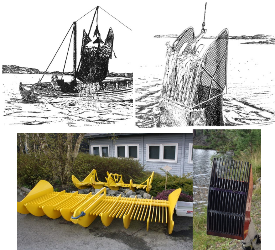
Figure 4. Three dredges and a berry picker. Top: early mechanised dredge with features combining that of a net and trawler (Adapted from Veia and Ask 2011, 490). Bottom left: Some newer trawlers displayed outside the Haugesund factory (author's own). On the commemorative plaque on the right we read that the tindetrålen in the back is one of the first to be developed "through a collaboration between the trawlers and the company". It had a design that "revolutionised harvest and made it possible to fill up boats fast and effectively". It lies on stones taken from the bottom of the seafloor that were removed in the wash basin and kelp cutter. Bottom right: Metallic berry picker from the 1980s (author's own).

The mechanisation of seaweed harvesting happened progressively but had a big impact on industrial harvesting capacities and on how seaweed would come to be appreciated anew, as a crop of the sea.