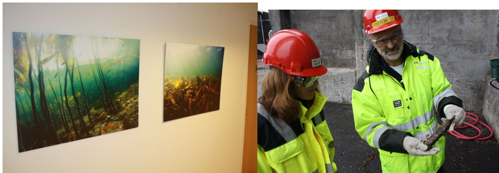
Figure 5. Left: An image of L. Hyperborea kelp forest hanging on the wall of the Haugesund factory of FMC; Right: high value alginate is found in the stipe.

The 1960s and 1970s, the period when seaweed harvesting regulation was formed, was also a period of intense intellectual production for ecological science and philosophy in Norway (Anker 2007). The so-called “deep ecology” philosophy (Næss 1973) influenced the public awareness of issues concerning the intrinsic value of nature and the potential for human destruction through industry. Intense political discussions were had regarding the creation of the first Norwegian national parks (from 1962 to 1971) and new hydroelectric power plants and dams in that period (Anker 2007, 456). Though this did not directly involve marine parks, and activities undertaken in the sea, it created a broader public awareness of the aesthetic and possible intrinsic value of natural environments.