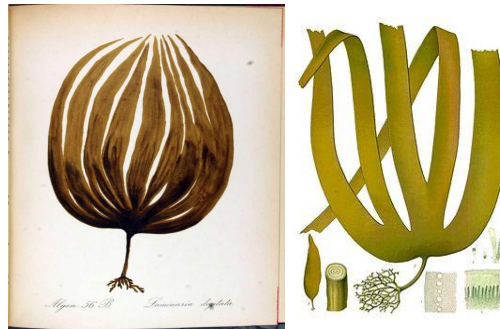
Figure 1. Laminaria digitata (left) and Laminaria hyperborea (right) 7

L. hyperborea form dense beds (also called “kelp forests”) that have a rich understory of flora and fauna. L. hyperborea individuals have a rigid upright stipe of about 1–2 meters and can reach up to 15 years of age. They are not adapted to strong wave impact, so they can break up relatively easily but they are able to grow with even 5 % surface light, and at 30m depth in Norway. They have large “blades”, which create a lot of shading for the flora and fauna underneath them, and that are striated to accommodate for the mechanical strains caused by wave impact (Werner and Kraan 2004, 5). Like other seaweed plants, Laminariales attach to the seafloor through a “holdfast”. This looks like the root site of a land plant, however its function is only to anchor the plant securely on the seafloor. Seaweed plants receive nutrients instead through their whole body, and only the largest species have some rudimentary internal sieve tubes/channels for mass transport.