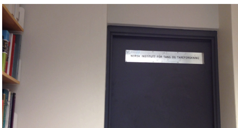
Figure 8. A mark of the identity and history of the NTNU cluster we worked with: an old sign hangs on the inside of the project leader’s door reading: Norsk Institutt for Tang- og Tareforskning – Norwegian Institute of Seaweed Research.

Norwegian-based industries on seaweed have been key drivers for scientific research. As discussed it was partly the investments made by Kierulf into Protan research which resulted in the production of pure sodium alginate in 1943, in return giving the company a market lead. The Norwegian Institute of Seaweed Research (Norsk Institutt for Tang- og Tareforskning, or NITT) was founded in 1949 by the then Royal Norwegian Council for Scientific and Industrial Research (NTNF) and it was directly funded by the research council as an independent institute until 1973-74.