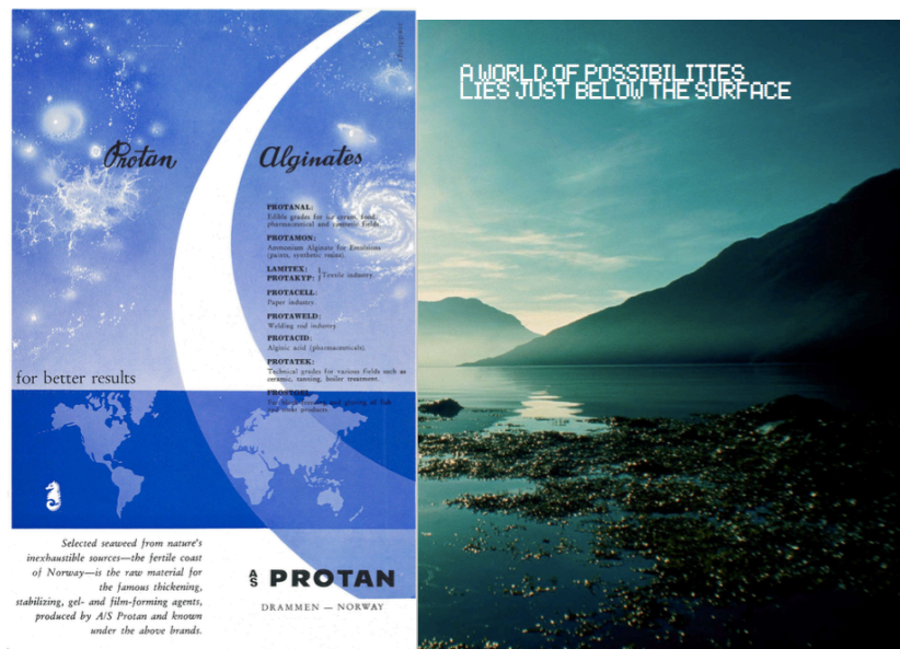
Figure 7. Advertisement of Protan products from 1962 and image reproduced from a current alginates brochure of FMC Biopolymer (2015).

substitute in other products, such as soap, toothpaste and jam. The company profits were invested in research on alginates under a new sister-company name, A/S Protan. In 1943 Protan scientists managed to produce pure sodium alginate. Although other Norwegian companies attempted alginate production after the war, Protan emerged as the one successful company, gradually establishing a monopoly in Norway and becoming a world-leading producer of alginate (Indergaard 2010, 106-107). Thus the political interest in withholding an income from Nazi government tax indirectly enabled the scientific and further economic development of the industry.