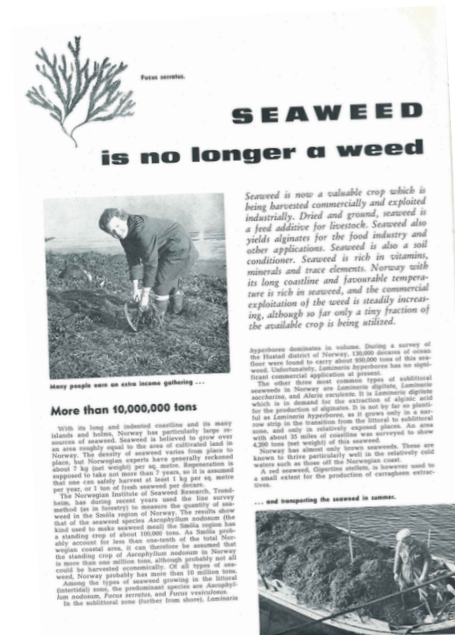
Figure 3. Excerpt from Norway Exports Fall issue of 1962, one year after the opening of the new alginate factory in Haugesund in 1961. Notice the depicted involvement of local people, women, and men manually harvesting seaweed. The caption on the top left and bottom right images reads “Many people earn an extra income gathering... ..and transporting the seaweed in summer” (p.62).

“Seaweed is no longer a weed”: thus begins a special section in the magazine “Norway Exports” published quarterly by the Export Council of Norway (Norway Exports 1962, 62-66) (Figure 3).