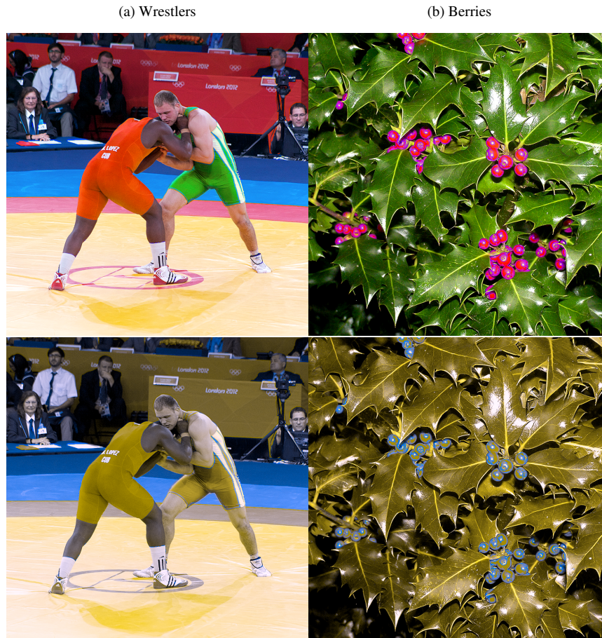
Figure 3: The first row shows the daltonized images with \alpha = 0.15 and one round of dilation, while the second row shows the deutan simulations. The images have been simulated using the Brettel simulation [1].

modified image by solving the Euler-Lagrange equation, which returns a Poisson equation that can be solved numerically through a gradient descent. We also introduce an “artificial mach band” option that creates a halo-like effect around chromatic edges to emphasize said edges.