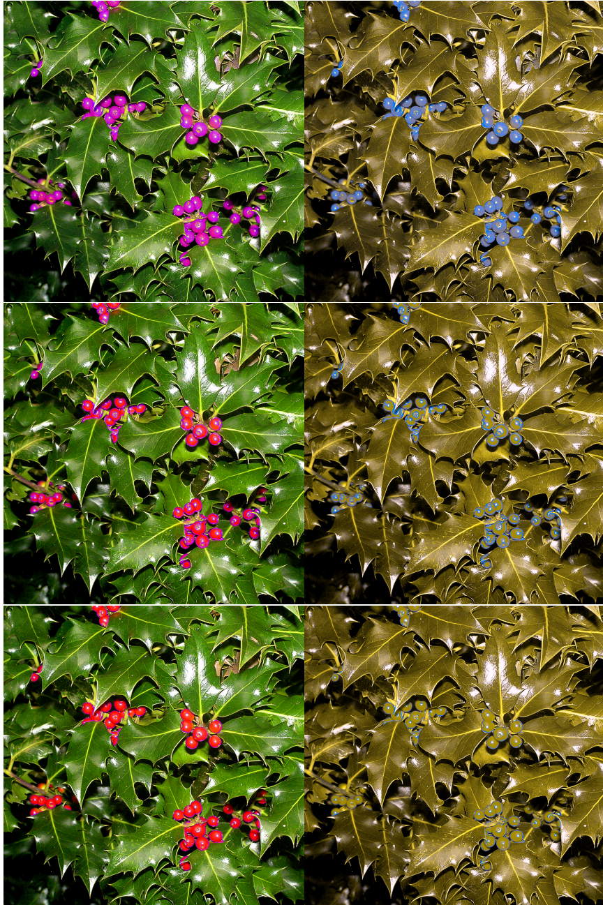
Figure 4: We used \varepsilon = 0.01 in the first row, \varepsilon = 0.20 in the second row, \varepsilon = 0.50 in the third row. The left column shows the daltonized versions, whereas the right columns represents the daltonized images simulated by the Brettel method for deuteranopes [1].

ing Understanding with Personalized Simulations of Colour Vision Deficiency. In ASSETS '12: The proceedings of the 14th international ACM SIGACCESS conference on Computers and accessibility , pages 167–174, Boulder, Colorado, USA, 2012. Association for Computing Machinery (ACM).