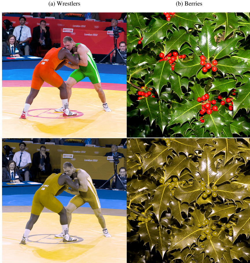
Figure 1: The first row shows the original images, while the second row shows the deutan simulations. The images have been simulated using the Brettel simulation [1].

color tasks. The edge marker also preserves the original natural colour, which is important in connotative or denotative color tasks. In the present paper, we show how this kind of edge enhancement can be implemented and discuss its performance on various image types. Our proposed method is a spatial recoloring method that changes colors at each point with respect to its surrounding according to the categorization in [12]. The method aims at improving chromatic edges and contrast in natural images for comparative, connotative and denotative color tasks.