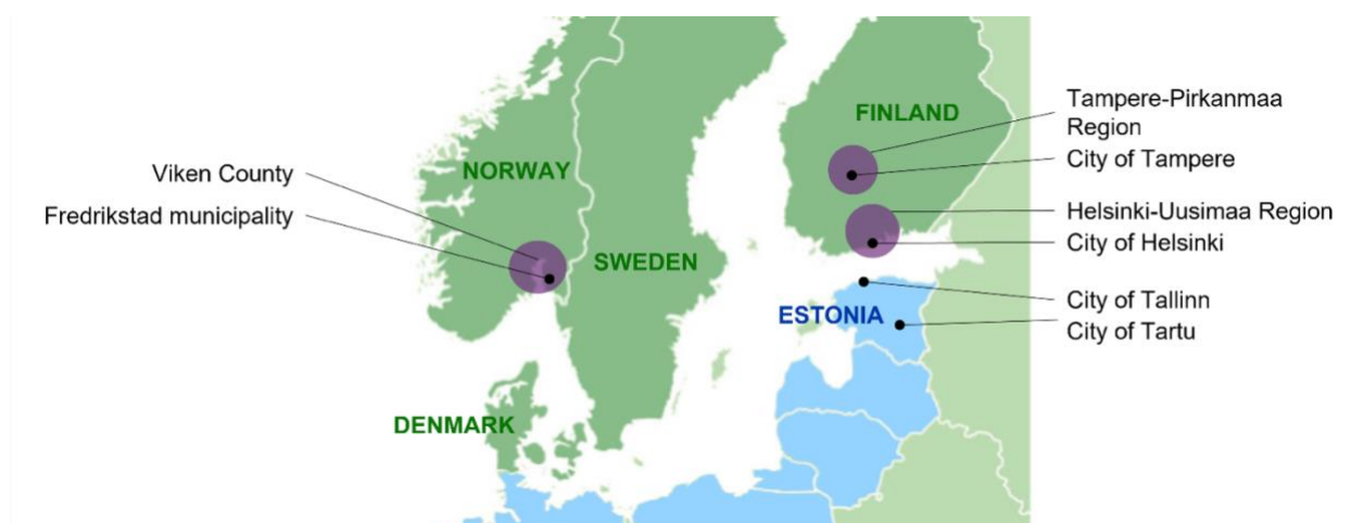
Figure 1: The case countries, regions and municipalities

This report understands CE as a sustainable economic model, which aims to minimize waste and optimize the use of resources. It is based on the idea of reducing the consumption of natural resources by narrowing, slowing down, or closing resource loops, where products, materials and resources are kept in use for as long as possible. To drive the transition towards a CE, several circular strategies can be implemented. Potting et al. (2017) introduced a 9R framework ( Error! Reference source not found. ) including 9 circular strategies, which depict different levels of high circularity (low R-number) to low circularity (high R-number). (Potting;Hekkert;Worrell;& Hanemaaijer, 2017).