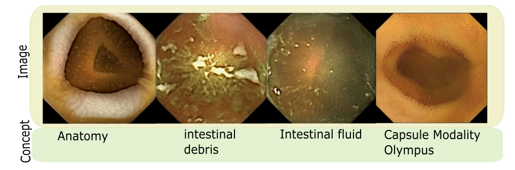
Fig. 3 Figure shows images for some candidate concepts that were not selected for pathology classification problem discussed in the main paper

ing point for concept curation saves both time and resources compared to starting from raw data and domain experts. The results thus far strongly motivate further exploration for further refining explanations, multiclass classifiers as well as other domains.