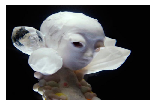
Figure 7. Pinar Yoldas: Designer Babies. HiCortex. (Reproduced by permission of the artist).