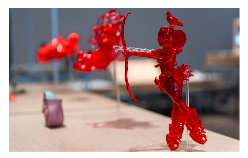
Figure 6. Pinar Yoldas: Designer Babies. Artemis. (Reproduced by permission of the artist).

Dreams of perfection are addressed in science by promises of new cures and longevity. Sci-art practices include meddling with futuristic dreams of a perfect body for instance by creating techno-freaks and -monsters (Orning, 2017). Examples of this are works by Patricia Piccinnini whose creations in silicone are depictions of humans in close relationship with hybrids and other