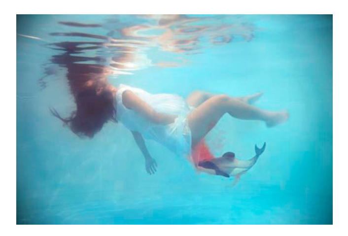
Figure 9. From Ai Hasegawa: I Wanna Deliver a Dolphin . Still from video. (Reproduced by permission of the artist).

The woman giving birth serves as a surrogate but also as a caring mother. The process mimics human reproduction, including a natural birth under water. The birth under water recalls the movement for natural birth outside of hospitals, whereas the specifications for modification of the uterus and placenta recall the procedures of ARTs – specifically the development of gestational surrogacy. Gestational surrogacy means that egg cells from another person are fertilised and implanted in the uterus of the surrogate and her body will be prepared to receive an embryo of different origin, like that of the human surrogate and the dolphin embryo. In the work, the surrogate mother and progeny emerge as two nearly unchanged species, human and animal.