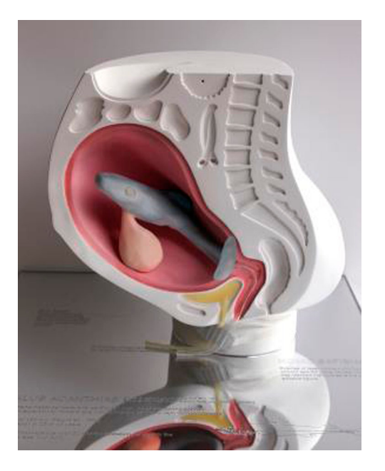
Figure 1. Ai Hasegawa, from I Wanna Deliver a Shark. (Reproduced by permission of the artist).

This project approaches the problem of human reproduction in an age of over-population and environmental crisis. With potential food shortages and a population of nearly nine billion people, would a new mother consider incubating and giving birth to an endangered species such as a shark, tuna or dolphin? This project introduces a new argument for giving birth to our food to satisfy our demands for nutrition and childbirth and discusses some of the technical details of how that might be possible. (Ai Hasegawa)<sup>1</sup>