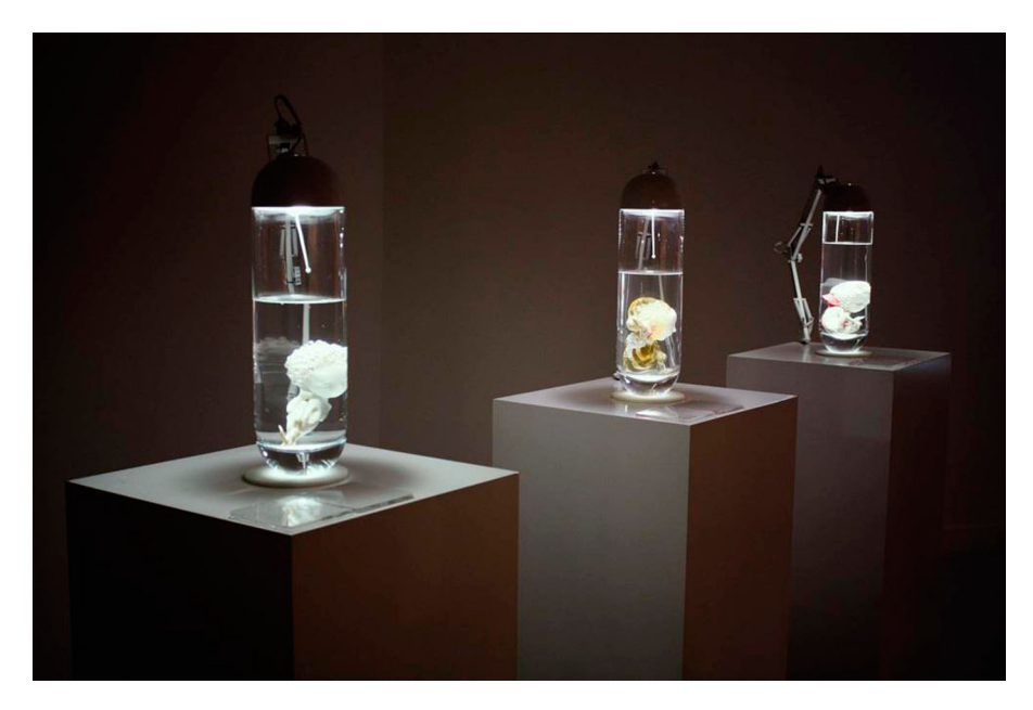
Figure 4. Pinar Yoldas: Designer Babies. (Reproduced by permission of the artist).

Uncovering the mysteries of nature has run parallel to biotechnical achievements for altering the process of conception, by IVF and other methods, and new technologies of surveillance and treatments of the embryo. Within the field of assisted reproduction, genetics is an emerging field both as basic and clinical research. This includes PGD (pre-implantation genetic diagnosis) meaning that with IVF treatment, embryos may be tested before they are inserted in the womb. A more radical step is to follow up with genetic modification, a step that points towards the gloomy notion of designer babies with qualities such as looks, intelligence and future health risks 'on demand'.