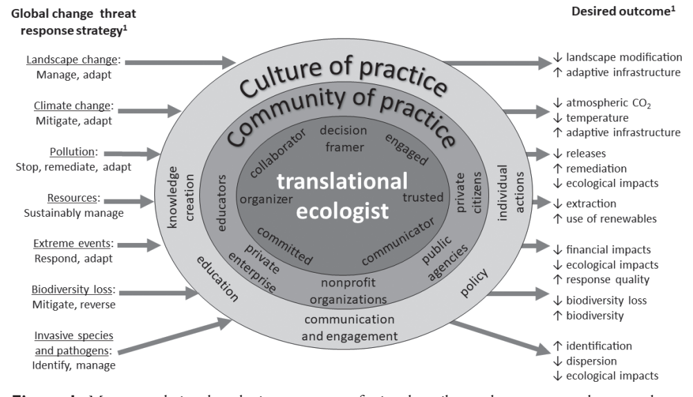
Figure 1. Many translational ecologists possess professional attributes that empower them to play a central role in converting resilience-building strategies into meaningful outcomes by serving as boundary spanners in a community of practice, and by cultivating a broader culture of practice. <sup>1</sup>Summarized from Table 1. Professional attributes (inner circle) were adapted from the "principles and related goals of translational ecology" enumerated by Enquist et al. (2017).

Translational science is imperative to forging inclusive, goal-oriented coalitions of stakeholders that are guided by theories of change and empowered by methodologies to rapidly and expansively co-create resilience to global change threats in ecological, social, and political contexts (Enquist et al. 2017; Ripple et al. 2017; IPCC 2018). Here, we encourage ecologists (and other people in similar positions) to engage more fully in translational actions addressing the seven major resilience challenges (Table 1; Figure 1), by proposing a framework (Figure 1) that lowers barriers to participation (Table 2) and promotes stronger relationships among stakeholders (Figure 2). We conclude by recommending specific actions that ecologists can take based on their capabilities, as well as evidence and demonstrated need.