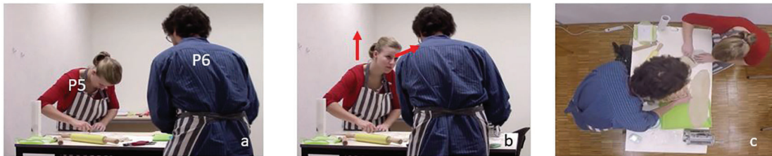
FIGURE 3 | Example of confirmation question in joint decision-making.

P5: Je coupe là? Shall I cut there? *is about to cut the dough* Fig.3a P6: ° Eu:h ouais °= Uh yeah P5: = On est d'accord? (.4) Do we agree? *lifts head and looks at P6* Fig.3b P6: Ouais (.2) >sinon on refera après< Yeah, Otherwise we will do it again after *nods* *P5 cuts the dough.....* Fig.3c