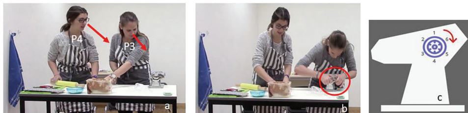
FIGURE 2 | Example of exploration questions while learning how to use tools.

Food preparation is a meaningful real-world task that can boost creativity (McCabe and de Waal Malefy, 2015) and have a positive impact on the self-esteem of people (Farmer et al., 2018). When food preparation occurs collaboratively, it strengthens social bonds by reinforcing family relationships, initiating and