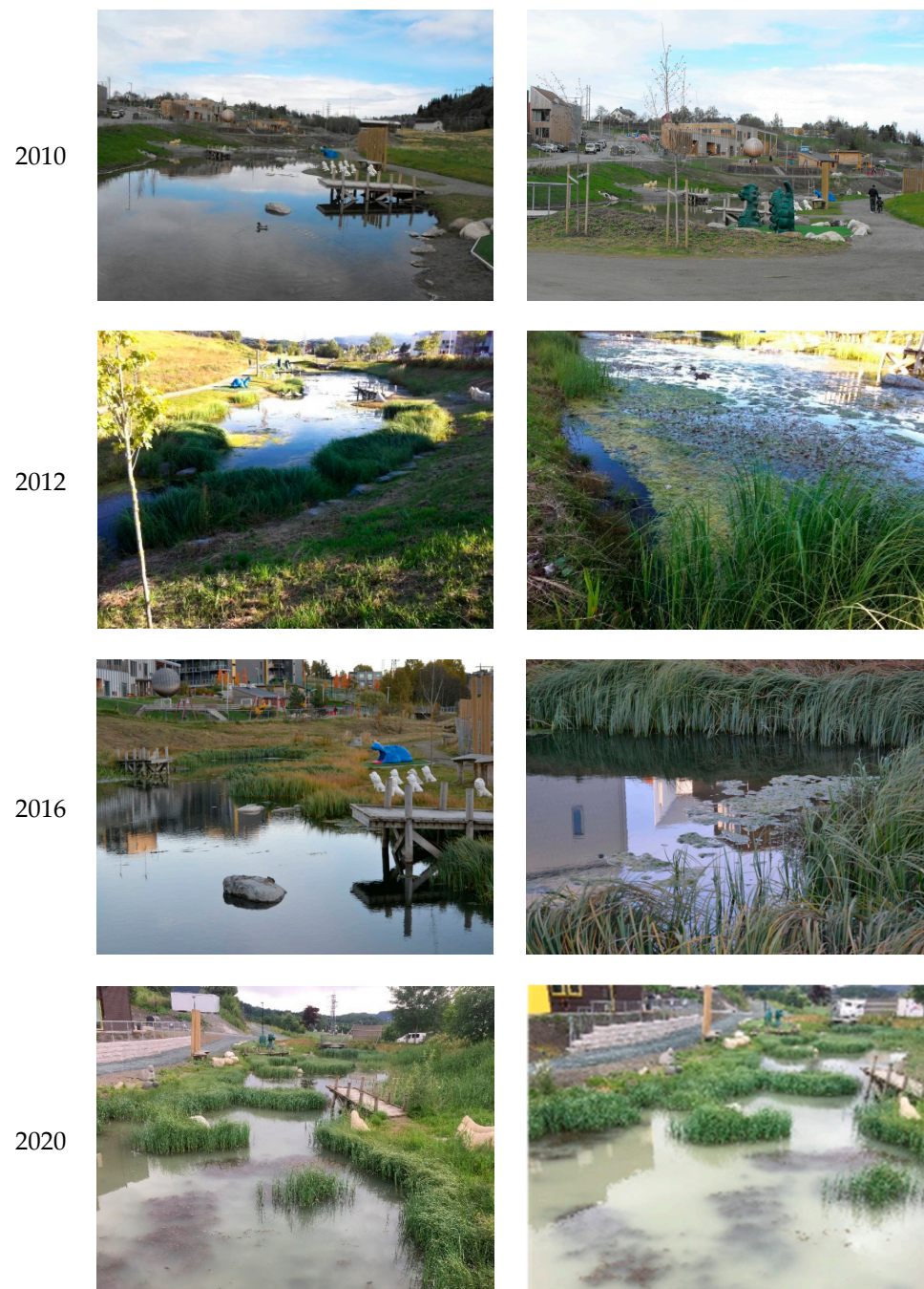
Figure 3. Photographic timeline of Blaklibekken site. 2010/2012 Photo: [30]. 2016 Photo: [22]. 2020 Photo: Author.

Within 2 years of the project's completion, the municipality started to receive numerous complaints regarding the site. These complaints were sent directly to the municipal offices, articles in local newspapers covered public dissatisfaction with the site, complaints were lodged with the city's political board and local community groups published scathing condemnations of the site when protesting the introduction of proposed SUDSs in other various neighborhoods [17,22,30,32].