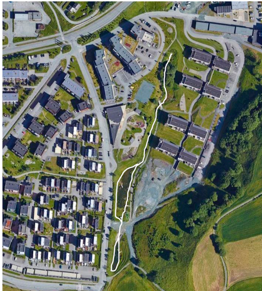
Figure 2. Aerial view of the Blaklibekken site.

The Blaklibekken site is a green corridor over 400 m in length and was proposed as a multi-functional combination of a SUDS project and public recreation space. The site was designed as a diversion facility for surface water discharged from the surrounding areas with retention and detention ponds, as the piped system downstream had limited capacity. The project was first completed with three ponds to manage water runoff, with two ponds close to the kindergarten and one further south. It was later found that the capacity of the first most northerly pond was poorly functioning and was converted into a stream in 2015 [17]. The site was meant to be landscaped for both wet and dry weather. A footpath followed the length of the site north to south. A bridge was added that traverses the north pond and docks jut out over both ponds. Numerous fixed and loose play fixtures were included in the original design and dispersed across the site. The site was managed for the first 3 years by the neighborhood developer that contracted the larger development and then management was taken over by the Trondheim municipality. Corrections were made to the smaller pond in 2012 [17]. Figure 3, which shows the photographic timeline of Blaklibekken, illustrates the environmental conditions, patterns of vegetative growth and changes in water quality from project completion in 2010 through 2021.