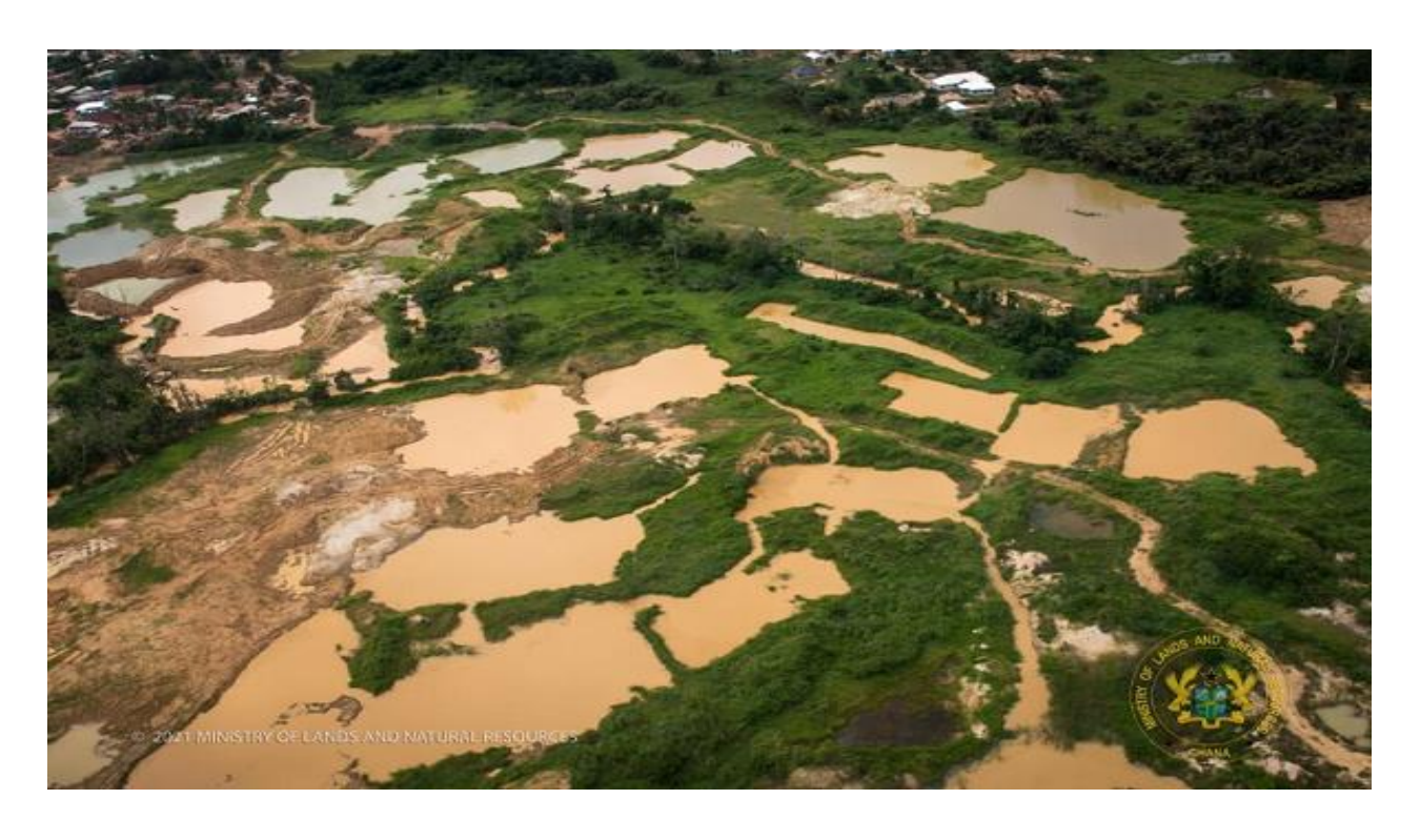
Figure 2: Picture showing the impact of galamsey on Ghana's forest