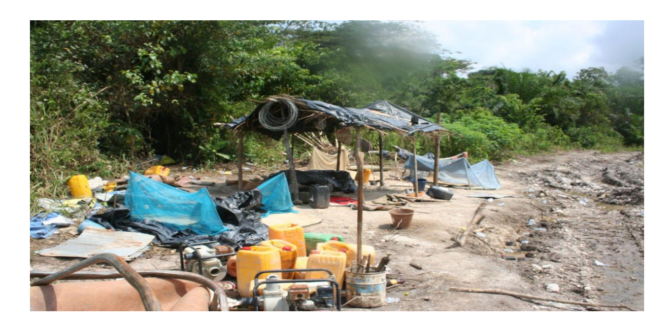
Figure 7: A galamsey site in the forest.