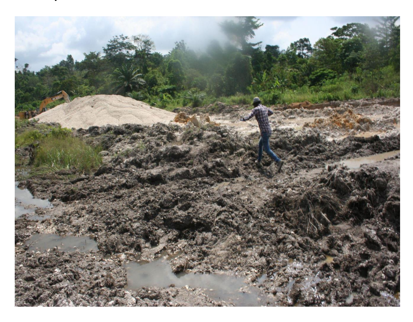
Figure 6. Degraded farmland left after galamsey operation

Figure 6 below shows degraded farmland abandoned after galamsey operations in the study community.