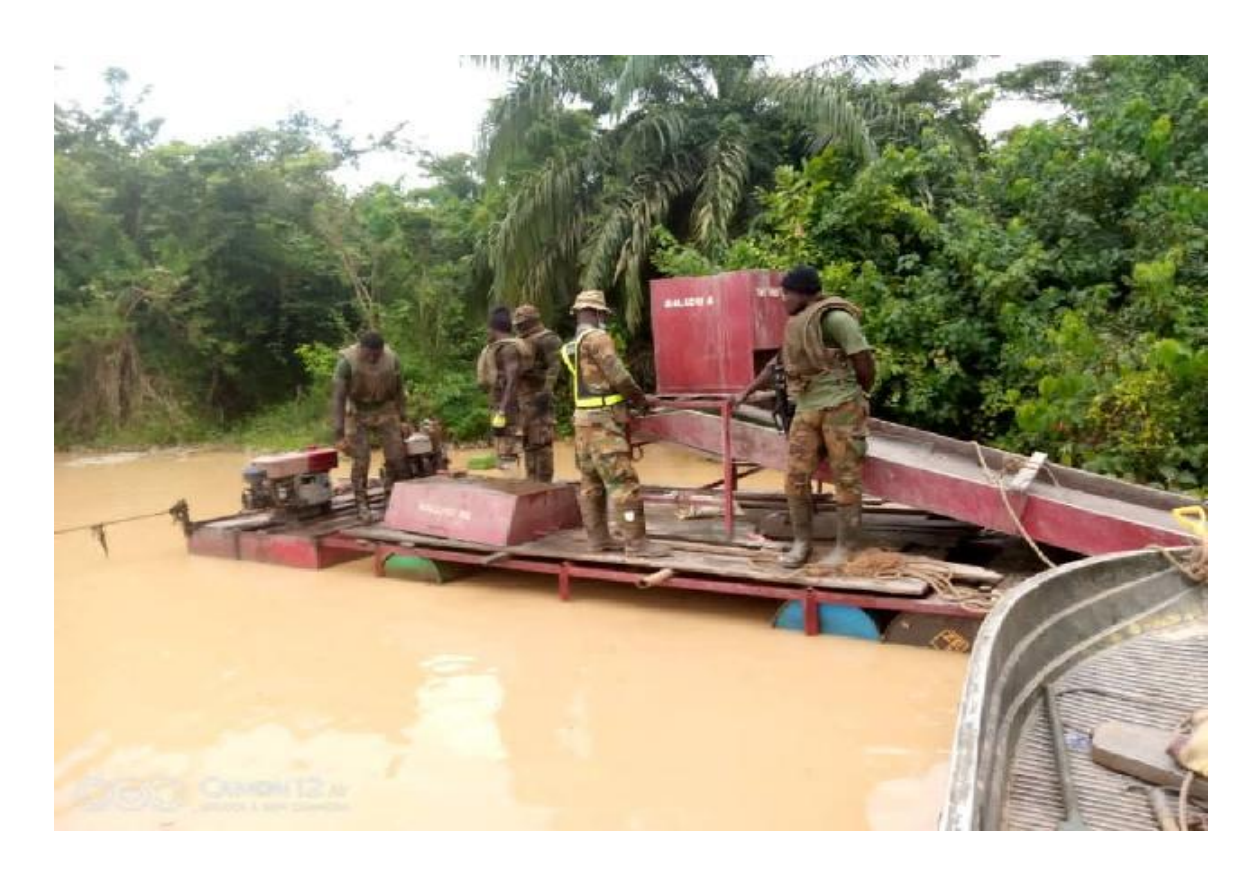
Figure 3: Seized Changfan machines on one of Ghana's rivers