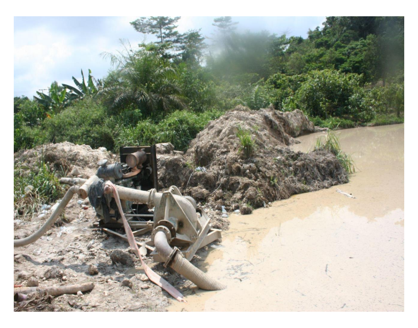
Figure 8. Polluted river due to activities of galamsey in the study community