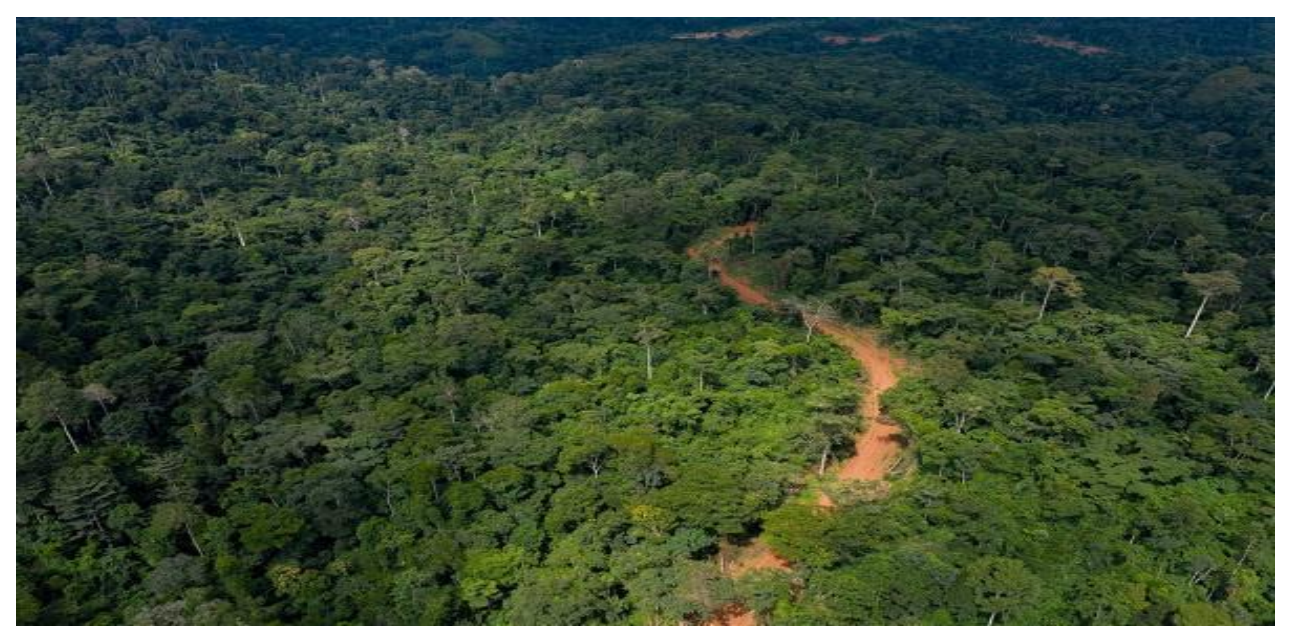
Figure 1. A picture showing the rich forest resource of Ghana before galamsey.

their use in the industry is dangerous to people's health and safety. Compounds containing cyanide ions are known to be rapidly acting poisons, which mainly interfere with the process of cellular respiration resulting in several ailments, illnesses, and even death (Jaszczak et al, 2017). The loss of agricultural land, farms, and the pollution of water bodies have made life difficult for the local people who depend on these natural resources for their livelihood (Owusu et al, 2019). As pointed out by (Aryee et al,2003), these negative impacts affect the local people who live near these resources and directly depend on them, and also inevitably affect and destroy the ecosystems. It affects the production of crops such as cocoa and oil palm. Figures 1 and 2 below show the state of Ghana's forest before and after the advent of galamsey. Figure 3 shows a picture of a Changfan machine seized by the military during an operation halt on Ghana's rivers.