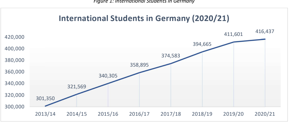
Figure 1: International Students in Germany

The growing importance of international student mobility is evident in the case of Germany. As of the autumn semester of 2020/21, more than 400 000 international students were enrolled in higher education institutions in Germany ("Germany International Student Statistics 2022", 2022). Figure 1 gives an example of the rapid growth of international student mobility to Germany, which increased by 38.19 per cent between 2013/14 and 2020/21.