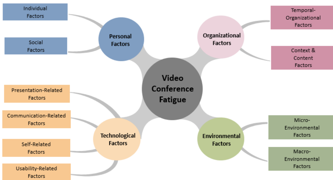
Figure 2. The 4-Dimensional (4D) Model of Videoconference Fatigue and its Causes.