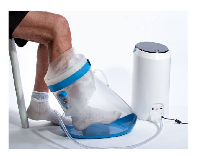
Fig 1. Device for lower extremity intermittent negative pressure treatment. Intermittent negative pressure is generated in a pressure chamber sealed around the patient's lower leg by a pump unit that is removing air from and venting the pressure chamber.

INP of -40 mmHg was applied in a pressure chamber sealed around the patient's lower leg in cycles of 10