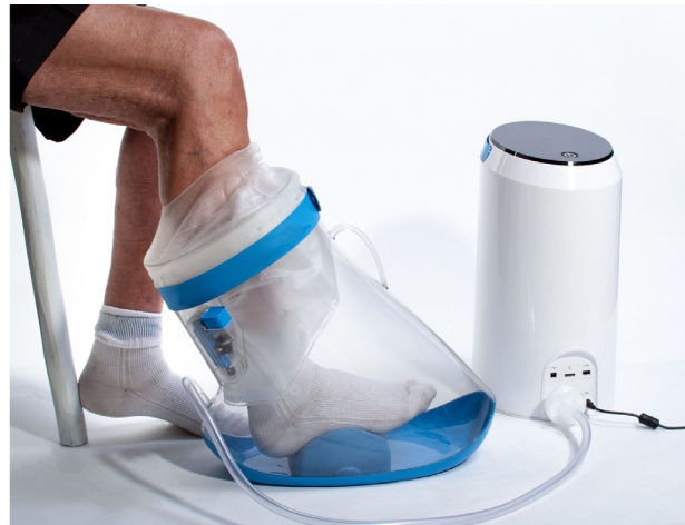
Fig 1. Device for lower extremity intermittent negative pressure treatment. Intermittent negative pressure is generated in a pressure chamber sealed around the patient's lower leg by a pump unit that is removing air from and venting the pressure chamber.

INP of -40 mmHg was applied in a pressure chamber sealed around the patient's lower leg in cycles of 10