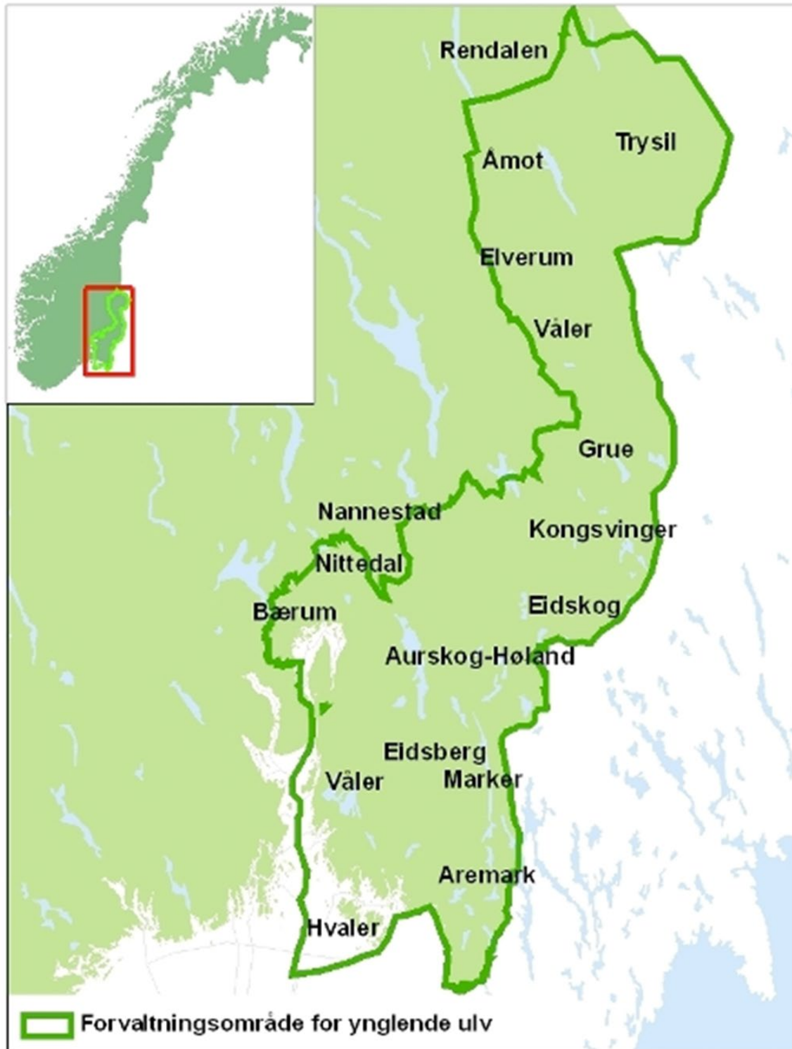
Figure 1: The wolf-zone is situated in south-east Norway, along the border with Sweden.