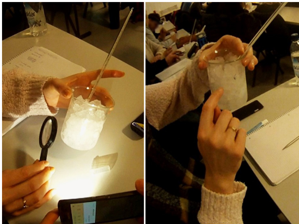
Figure 3. Pre-service teachers observe the frost layer on the beaker using a magnifying glass and touching the beaker.

Scott (2003). Observations were the basis for the descriptions, and PSTs used a rich variety of observations to back up their descriptions. All groups observed the phenomenon visually with and without a magnifying glass and touched the condensed water and ice on the outside of the beaker. One group even used their olfactory senses to observe the content of the beaker. Examples of student observations can be seen in Figure 3 and in the following quotations.