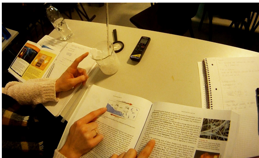
Figure 4. A student pair using the textbook to help develop their explanation of matter on the micro level.