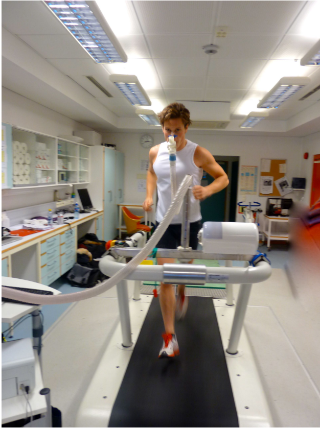
Figure 1. Measuring maximal oxygen uptake (picture used with permission).