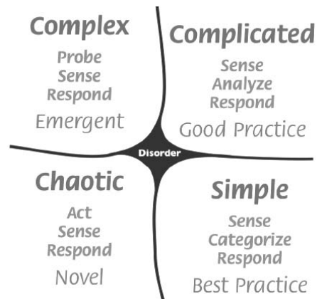
Fig. 1. The Cynefin Framework

The Cynefin framework (Figure 1) is a decision-making tool from the field of knowledge management and complexity science [16]. It is intended to help its users make sense of the current situation in order to act accordingly. To this end, it splits decision-making circumstances into five domains, discussed below. In the context of ISUs, it can help us better understand why practices and methods applied in ISUs either support or do not support their service and business development. We utilized the Cynefin framework, as it was adopted successfully in research about software startup before [31] (section IV).