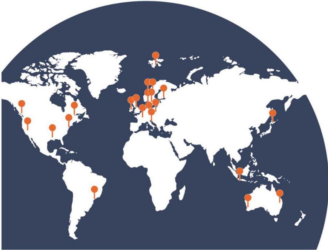
Figure 1. Location overview of geotechnical test sites presented during 1 st ISGTS.

Figure 1 presents the approximate worldwide location of the 22 different GeoTest sites included in this Special Issue. The test sites are in 13 different countries all over the world, from North America, South America, Europe, Australia and Asia.