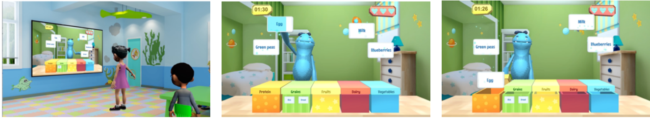
Figure 1: Marvy Learns requires a child to match an item to a labelled box according to its attributes. left: initiate a selection: child assesses item cards labelled: bread, green peas, blueberries, milk, and egg, for sorting into labelled boxes. centre: selection process: child chooses the egg card and selection begins. The card is fully selected and movable once it has filled with blue background. right: card categorisation: child has moved the egg card into the box labelled Protein.