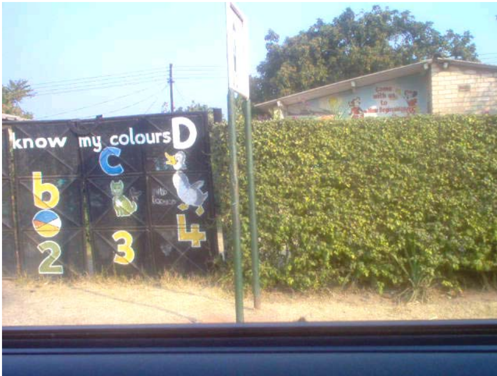
Plate 6.4: Purchased House turned into a Pre-school