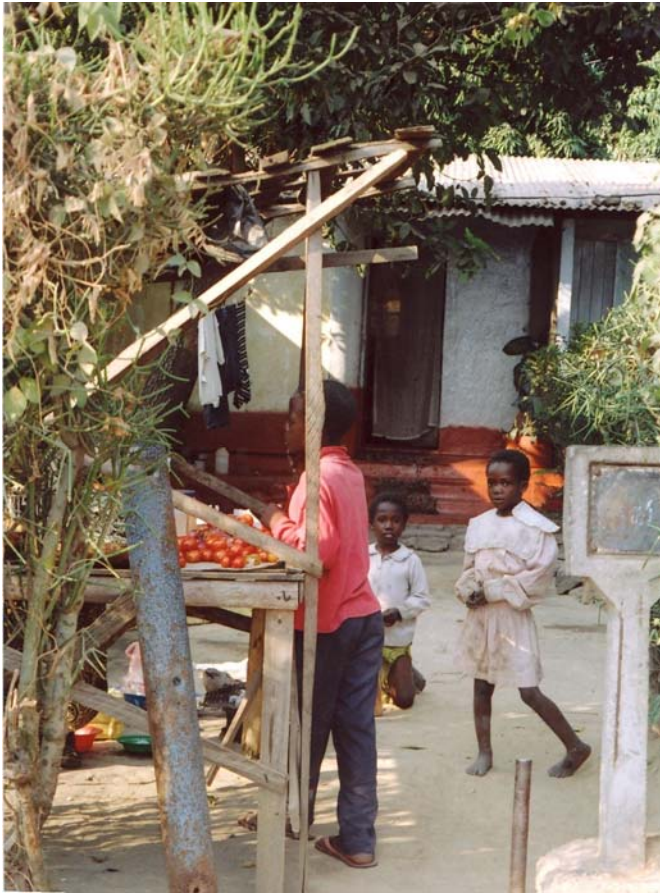
Plate 6.1: Trading from Home

Source: Field Photo taken by Fitzpatrick Chisanga (Research Assistant), July 2004.