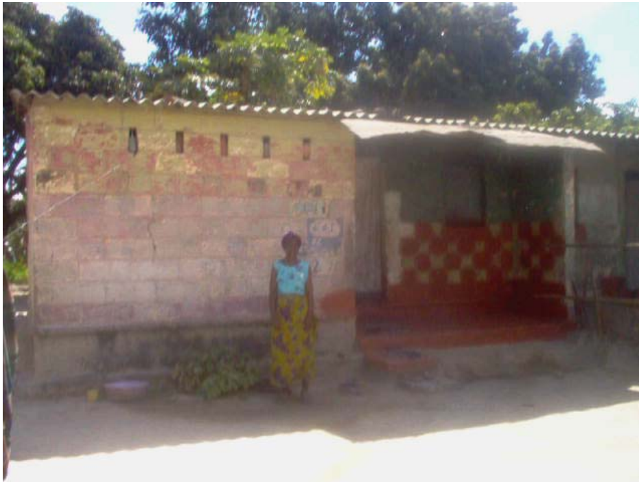
Plate 6.5: Low-cost house