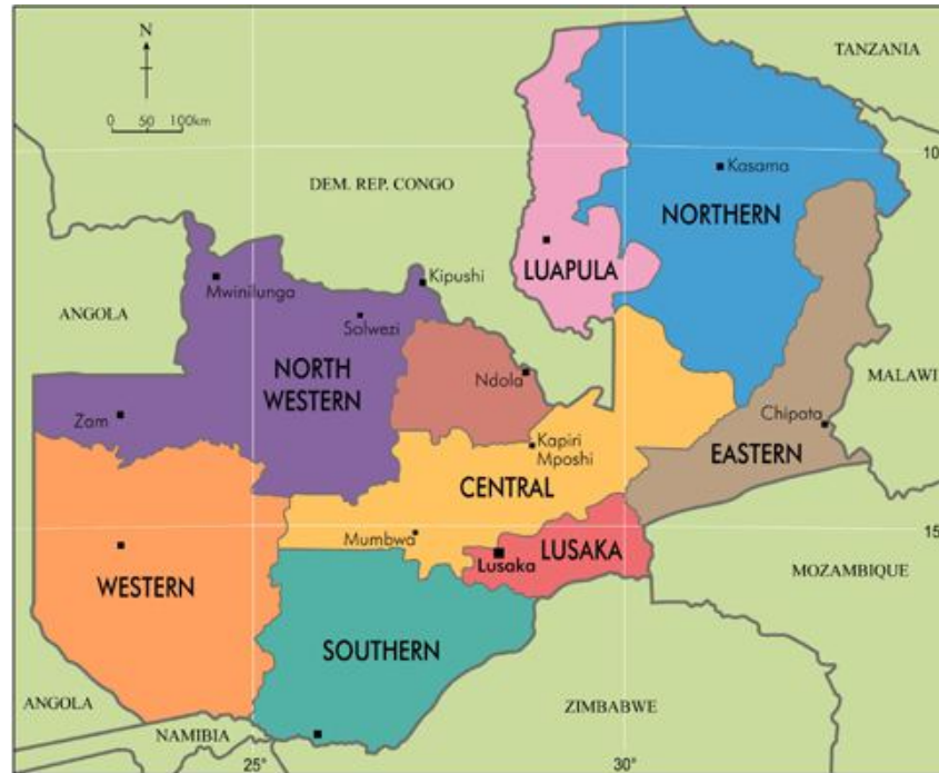
Fig. 2.1 Map of Zambia Showing Administrative Boundaries