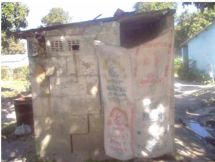
Plate 6.6: Showing a toilet/bathroom