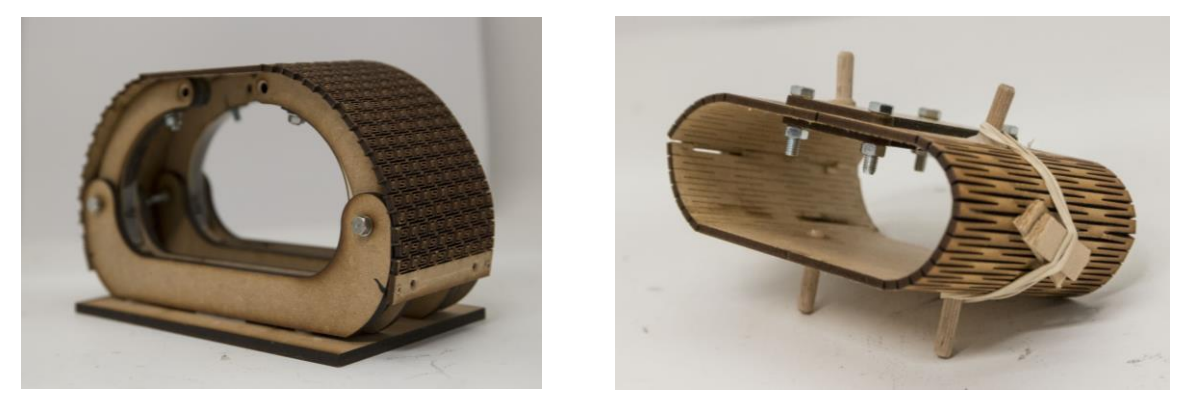
Figure 2. Prototypes built using living hinges

The project case illustrating this method of prototyping is the conceptual prototyping of a new chest for resuscitation mannequins. The project was challenged with generating new concept ideas for a training mannequin by mimicking the human chest. This required concepts to have similar shape and deformation as a chest would, which inspired the creation of multiple concepts whereas two can be seen in Figure 2. The designers used simple 2D drawings to run the laser cutting operation, which meant little time was spent in virtual prototyping environment. In addition, the speed of fabrication, made it possible for the design team to create multiple design alternatives, hence, adapt quickly to new insights. As seen in Figure 2, the design experimented with different cut patterns that enabled one or two degrees of freedom for the compression mechanism.