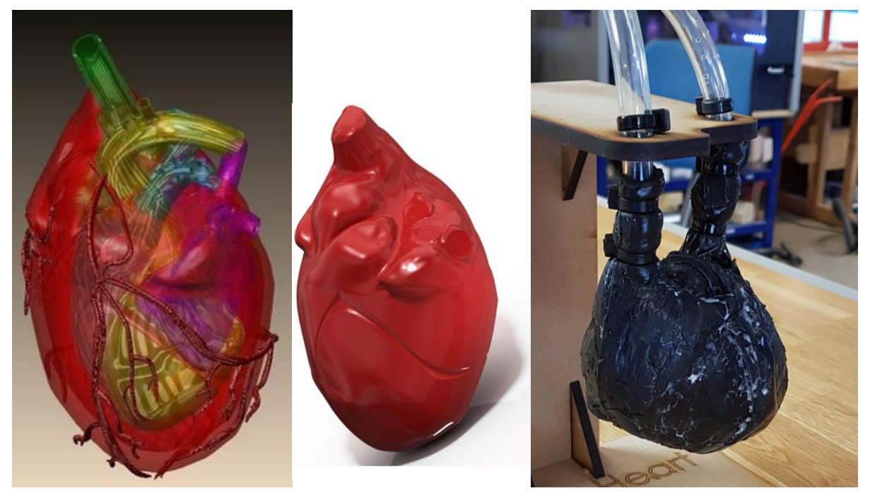
Figure 5. A human heart represented by a virtual prototype (left and centre) and a physical phantom (right) built using moulding with flexible materials

This method of prototyping is relatively slow, as it requires several sequential steps to produce a testable prototype. The production of the mould negatives with FFF (both in CAD and the fabrication itself) is time consuming, and when coupled with the silicone curing time, the per-prototype iteration time until physical testing can start is long. While this case is illustrating mould fabrication using FFF, other methods such as clay casting, manual sculpting and subtractive manufacturing might be more suitable in other cases. As mould fabrication is a means of prototyping moulds, it is in the context of this paper worth noting that efforts in prototyping the moulds affect both attributes of the flexible porotypes as well as activity performance in terms of time and ability to alter designs. One example is how the resolution and fidelity of moulded parts are governed by the surface finish and geometrical design freedom of the moulds, giving FFF advantages of being little constrained in terms of geometry, but subjected to rough surfaces as a result of fabrication technique.