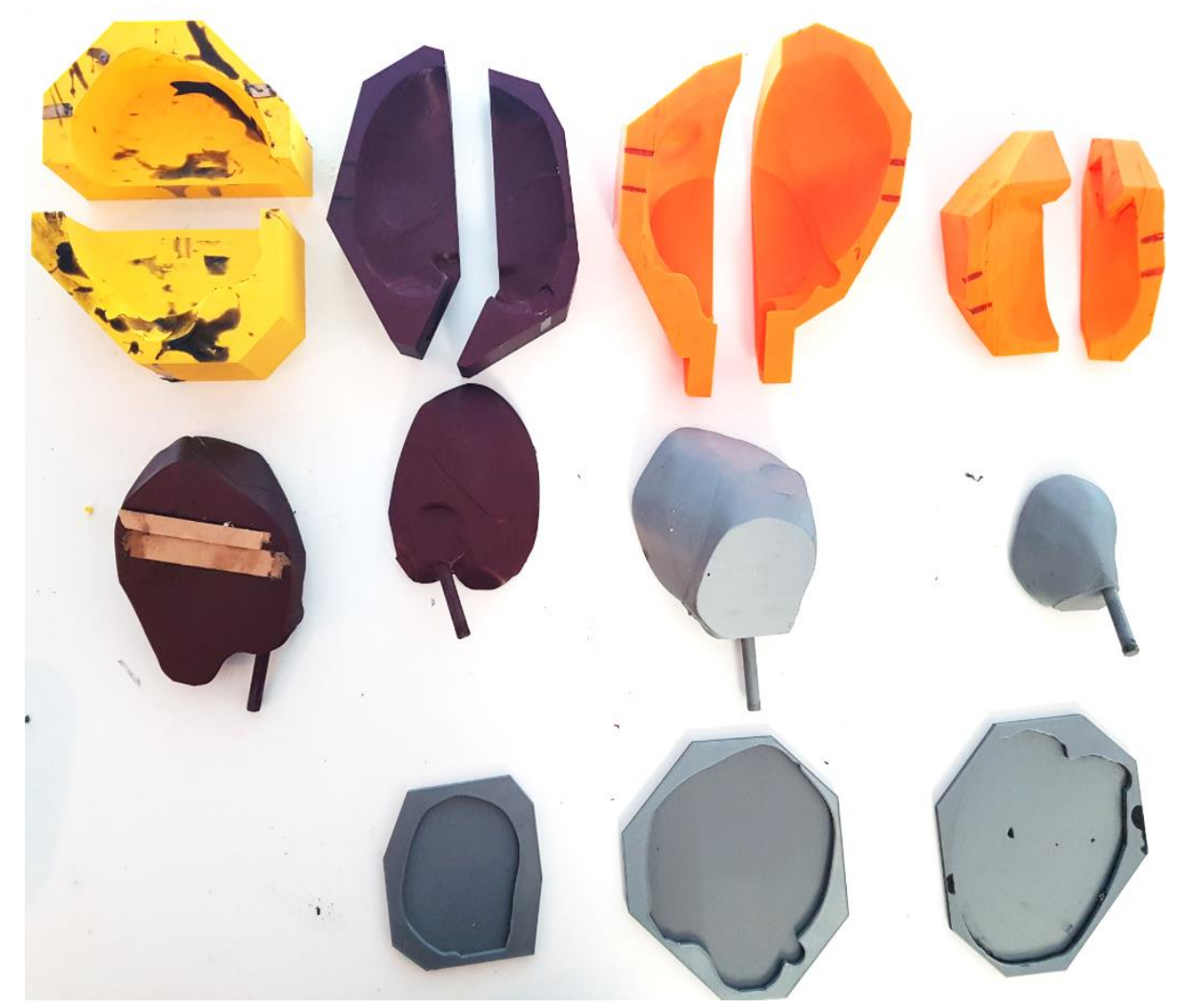
Figure 4. Mould negatives built using rigid materials that were used for moulding flexible phantom hearts with flexible material

The case example used to demonstrate this prototyping method, a challenge of fabricating and testing a phantom heart in a composite silicone material is considered. This phantom heart was to be used for research on heart flow and ultrasound imaging. To create this phantom, a contrast material was added the silicone to make the part visible on the ultrasonic imaging equipment. For the phantom to achieve flow conditions as found in real heart, the physical model had to replicate key anatomical features of a human heart. High resolution and fidelity were hereby needed to fulfil flow conditions, shape resemblance, and deformation resemblance to a real heart. An additional point to make is that the phantom needed to withstand the internal pressure present as the closed liquid system where to be displayed in air rather than dispersed in liquid. In this case, the heart was first prototyped virtually to create the mould negatives using fused filament fabrication, as shown in Figure 4, and was then moulded using silicone, as shown in Figure 5.