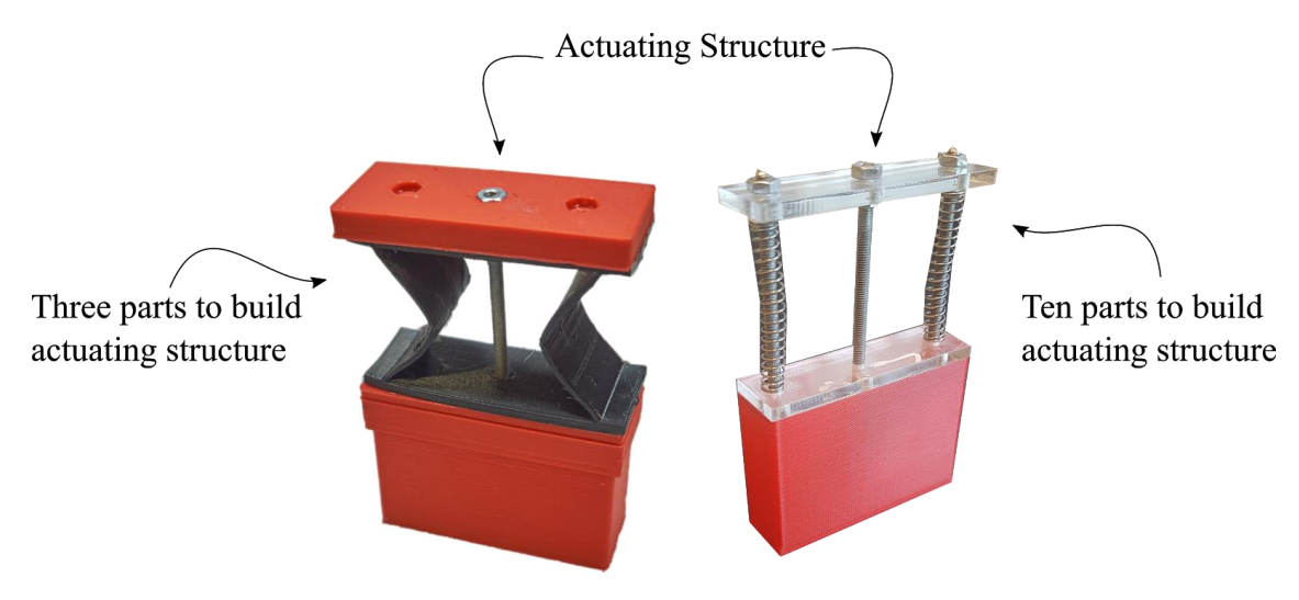
Figure 3. Prototypes built by using fused filament fabrication

The case illustrating this prototyping method, is the development of a spring mechanism for a personal drug mixing container. For this case example, there was a need to reduce mechanical complexity as part count and assembly made the concept prone to jamming and backlash. By drawing on the advantages of FFF with flexible materials it was possible to make a conceptual model, as seen in Figure 3. of high fidelity and resolution, fitting the assembly constraints.