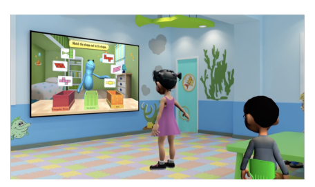
(a) player is presented with geometric shapes to (b) player gestures and Marvy's body moves in sort into labelled boxes using the avatar, Marvy.

Our sample was composed of 26 typically developing children (10 F, 16 M) with an average age of 10.95 years (SD = 0.21 years). All children participated in 6 game play sessions, for which they received a gift card for their participation. All procedures were approved by the Norwegian Centre for Research Data, (i.e., a national human research ethics organisation) and all children and their guardians provided verbal/written informed assent/consent, respectively, prior to participation.