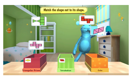
sync to select the geometric shape.