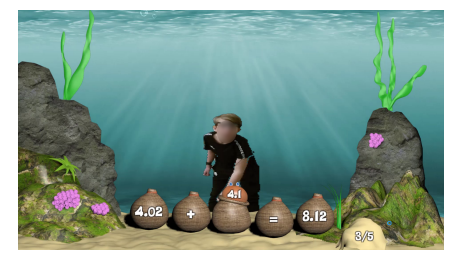
(c) player bends down to guide the selected jellyfish to the empty basket completing the equation.