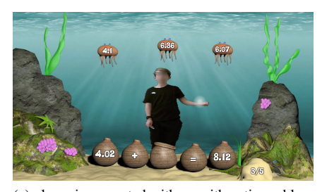
(a) player is presented with an arithmetic problem to solve using a photo-realistic avatar.