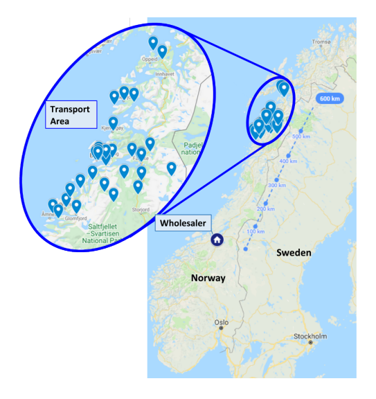
Fig. 2. Location of the wholesaler and the transport area