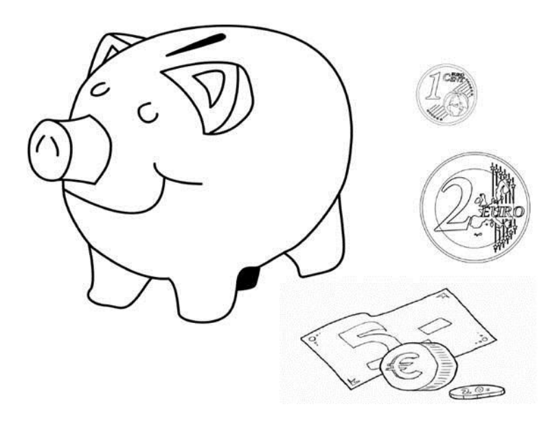
Appendix 3a: Coloring Sheets for Individual Interviews with Children – Piggy Bank and Purse