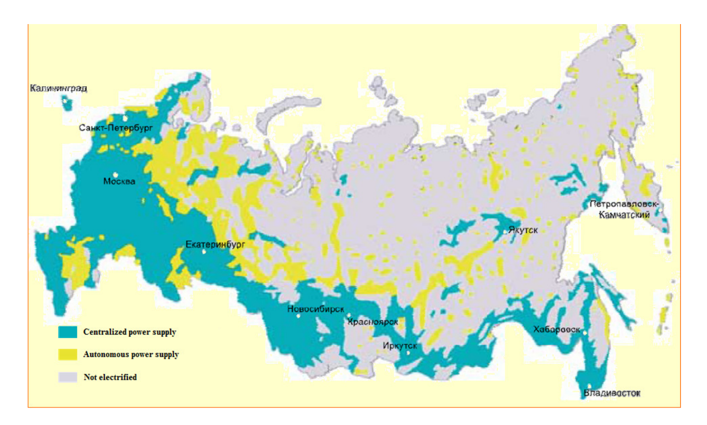
Figure 4. Energy supply on the territory of the Russian Federation. (Source: Popel, 2011)

In addition, many regions in Russia are subject to power shortages and are in need of fuel and energy supply.