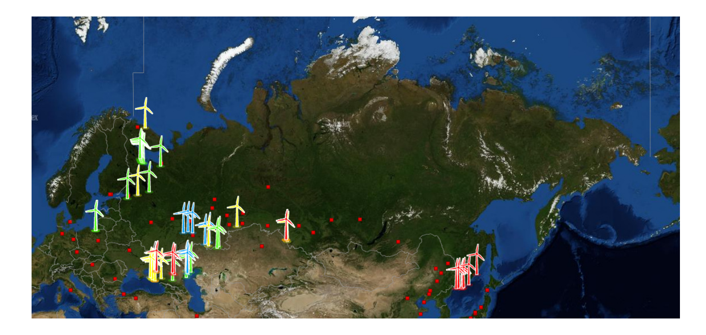
Figure 2. Map of Wind projects in Russia<sup>11</sup>