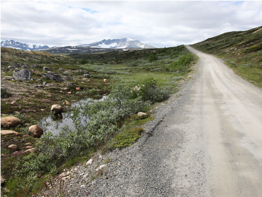
Figure 2. The road to Snøheim in Dovrefjell (looking north-west), with Snøhetta in the background.

respect, there are long traditions of cooperation at the local level between different actors and public management, as well as active participation by individuals and organizations.