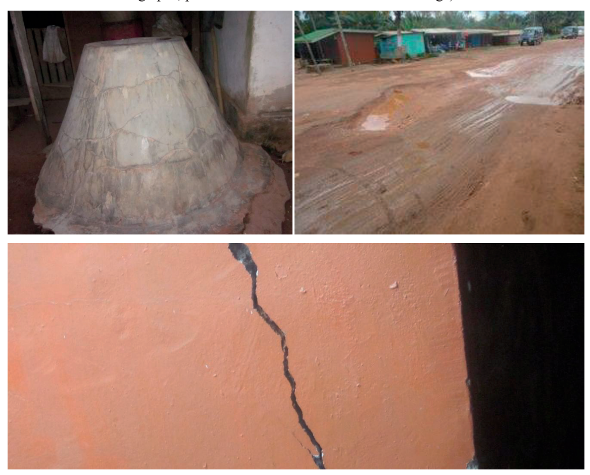
Figure 4 Pictures showing impacts on physical assets of farmers (from top left: Cracks in water storage pot; pot holes on roads and cracks in buildings)