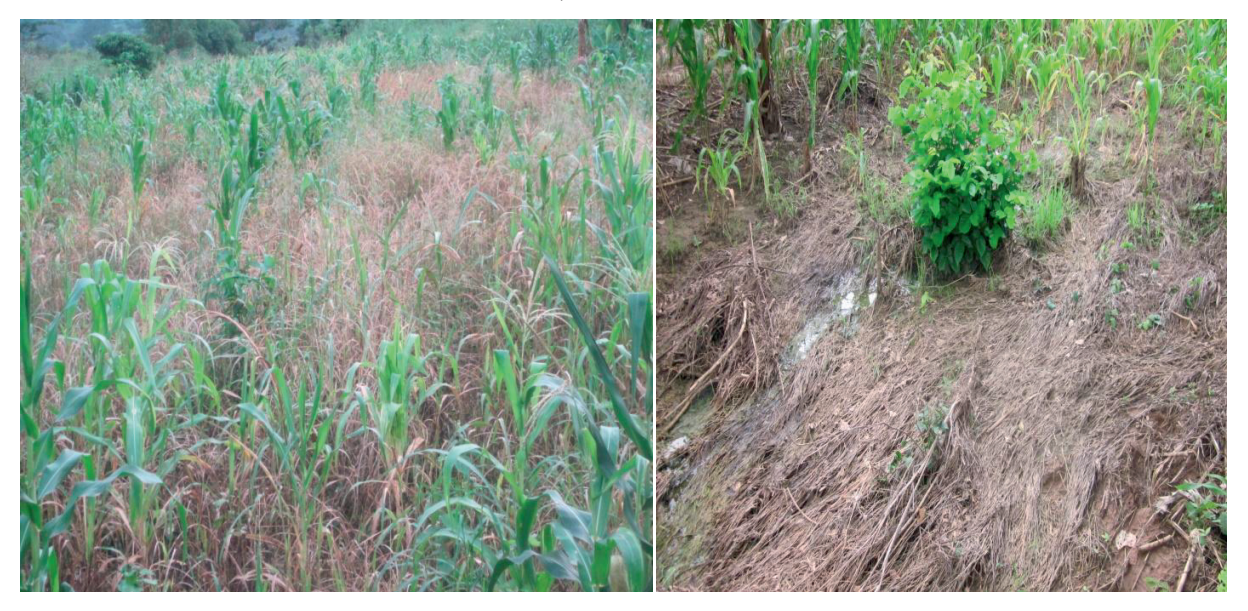
Figure 5 Pictures showing impacts on farmers crops and land (From left, reddish brown maize leafs and flooded farm)